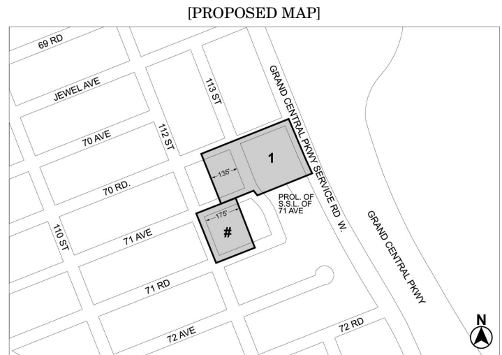
Legend: Mandatory Inclusionary Housing Program Area see Section 23-154(d)(3) Area 1 - 4/9/19 MIH Program Option 1 Area # - [date of adoption] MIH Program Option 1 and Option 2