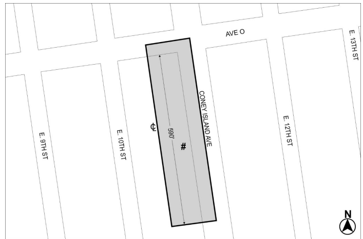
Map 5 – [date of adoption]