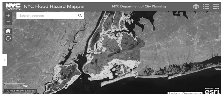
Figure 1: NYC Department of City Planning Flood Hazard Mapper