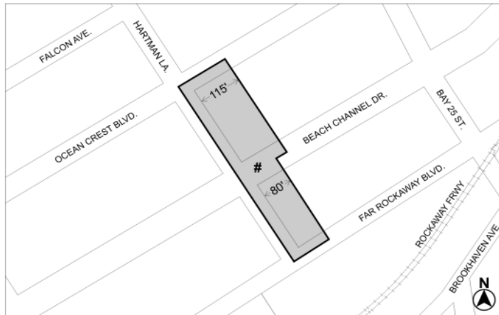
Mandatory Inclusionary Housing Area see Section 23-154(d)(3) Area # — [date of adoption] — MIH Program Option 1 and Option 2

Portion of Community District 14, Queens