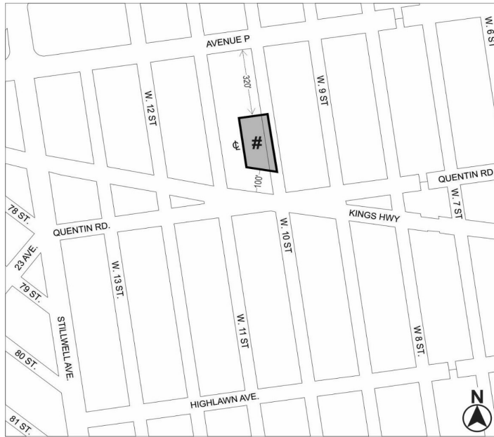
Mandatory Inclusionary Housing Area see Section 23-154(d)(3)

Area # - [date of adoption] - MIH Program Option 1 and Option 2