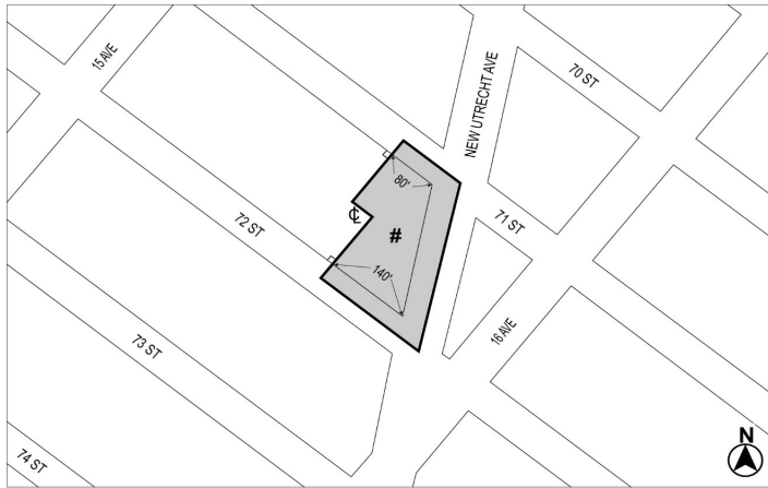
Mandatory Inclusionary Housing Program Area see Section 23-154(d)(3) Area # — [date of adoption] MIH Program Option 1 and Option 2

Portion of Community District 11, Brooklyn ***