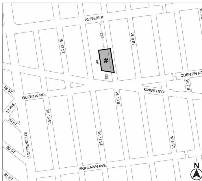
Mandatory Inclusionary Housing Area see Section 23-154(d)(3)

Area # - [date of adoption] - MIH Program Option 1 and Option 2