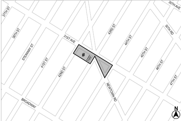
Mandatory Inclusionary Housing Program Area see Section 23-154(d)(3) Area # — [date of adoption] MIH Program Option 1 and Option 2