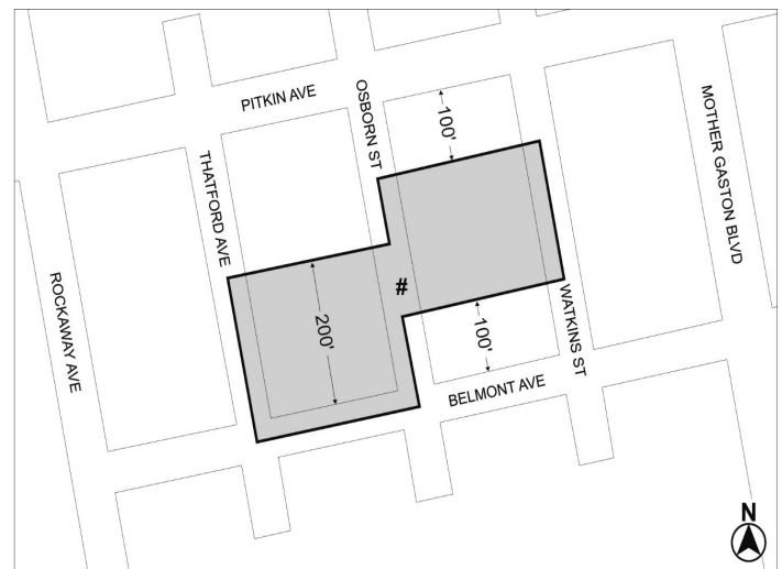
Mandatory Inclusionary Housing Program Area see Section 23-154(d)(3) Area # - [date of adoption] MIH Program Option 1 and Option 2

Portion of Community District 16, Brooklyn