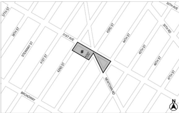
■ Mandatory Inclusionary Housing Program Area see Section 23-154(d)(3) Area # — [date of adoption] MIH Program Option 1 and Option 2