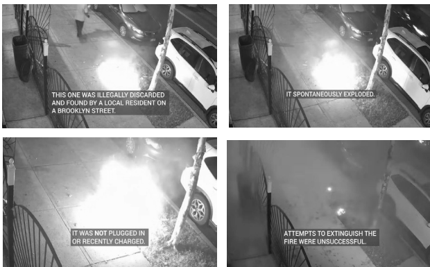
WHAT YOU NEED TO KNOW ABOUT E-SAFETY (SEE NEXT PAGE)

Lithium-ion batteries that have been damaged or tampered with are particularly dangerous. One such battery that was discarded on a City street burned for 10 minutes, continuously exploding and spreading flaming debris. See the video at: YouTube Link . For information about safe disposal of lithium-ion batteries, visit www.FDNYsmart.org .