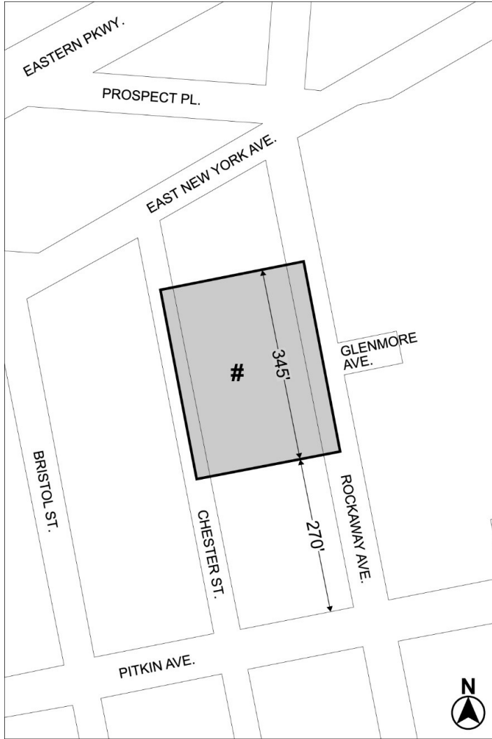
Map 6 – [date of adoption]