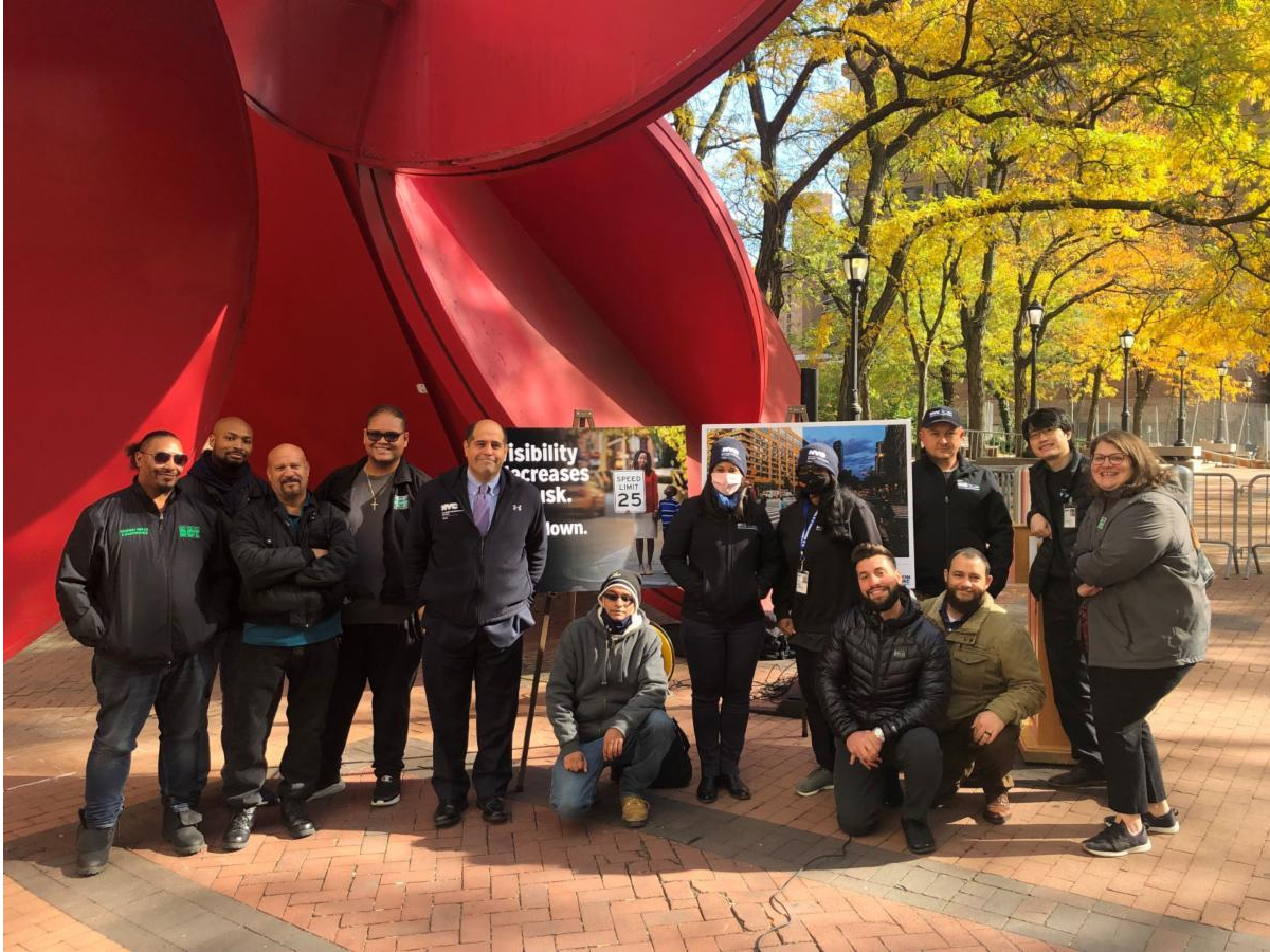
DCAS fleet staff joined DOT staff at the dusk to darkness announcement at One Police Plaza.

Through our Vision Zero Safe Fleet Transition Plan (SFTP), DCAS is taking some steps to make night driving safer for fleet operators. These include adaptive headlights, heated mirrors, safety lights for work trucks, and telematics to monitor driving behaviors. We discuss the dangers of night and bad weather driving in our safety training for all fleet operators.