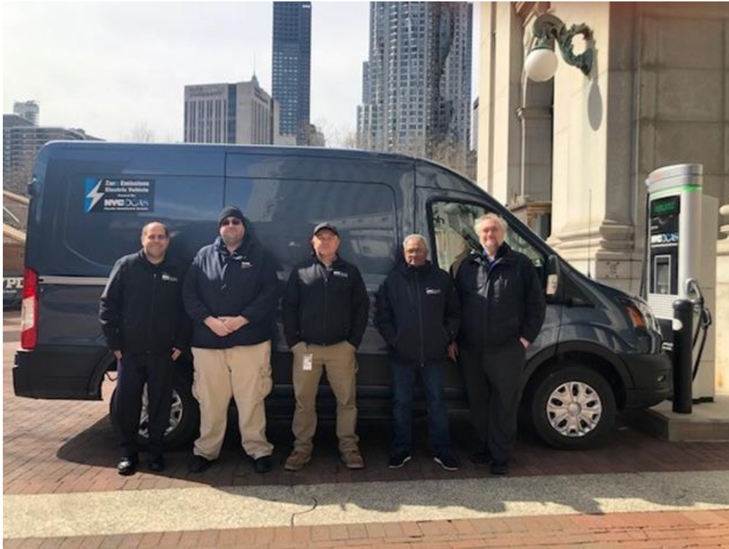
DCAS Fleet Services team with their new electric service van.

The Field Services Unit has spent the last year conducting a full review of all of fleet's charging, developing an expertise on servicing and repair, identifying replacement parts, and tackling the out-of-service chargers. In the last year, they have achieved a 67% reduction in down chargers with a goal of no more than 5% out of service at any time. The unit is now our go-to team for EV charging service issues citywide.