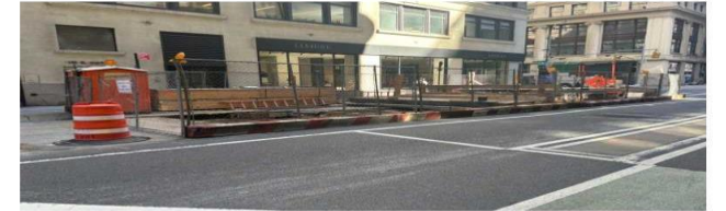
Hand care excavations on E. 29 th Street between Madison Avenue and 5 th Avenue.

Accommodation for individuals with Disabilities - If this project may uniquely impact you or someone you know, please contact the project CCL and/or RE as soon as possible to inform them of your situation or concern.