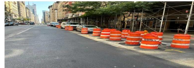
Final restorations on 5 th Avenue between E. 15 th Street and E. 16 th Street.

In the Chelsea location, final restoration operations will continue. In the Flatiron location, final restorations and removal of storage fences are scheduled. In NoMad, the contractor will continue hand care excavation operations.