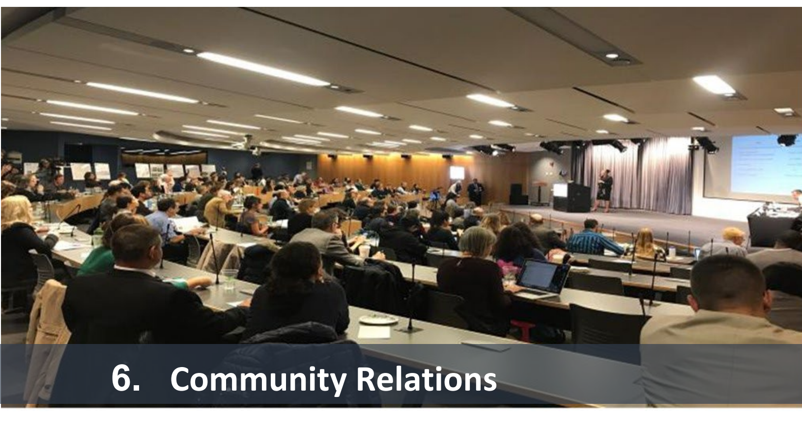
*Public Participation Plan meeting photo taken prior to 3/2020, pre-COVID-19 distancing requirements.

DEP's Public Participation Plan was released to the public on June 26, 2012 and describes the multi-pronged tools and activities DEP will utilize to inform and involve diverse stakeholders and the broader public throughout the LTCP process. The Plan provides a framework for communicating with and soliciting input from interested stakeholders on water quality and the challenges and opportunities for CSO controls.