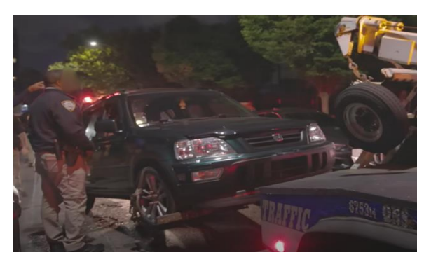
Figure 1: Example of CRT uniform