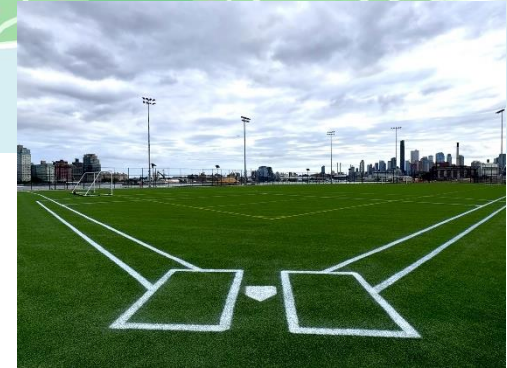
Ballfields 1 & 2 - September 2024

Questions? Preguntas? 问题?: Contact Vanessa Gomez at (347) 628-8724 or ESCRCCL1@ddccr.com , or via web inquiry: www.nyc.gov/escr/contact . During non-construction hours, please contact the New York City Government Services and Information Hotline at 311 or Universal Emergency Number 911 .