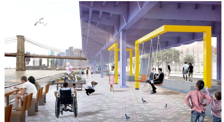
Rendering of Esplanade between Catherine Slip and Market Slip