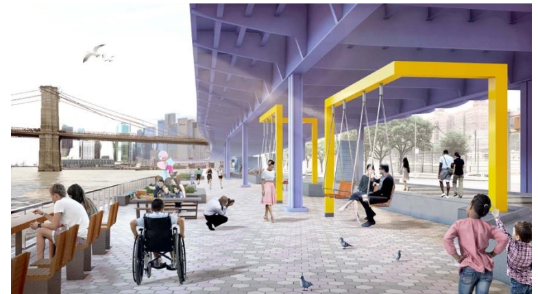
Rendering of Esplanade between Catherine Slip and Market Slip