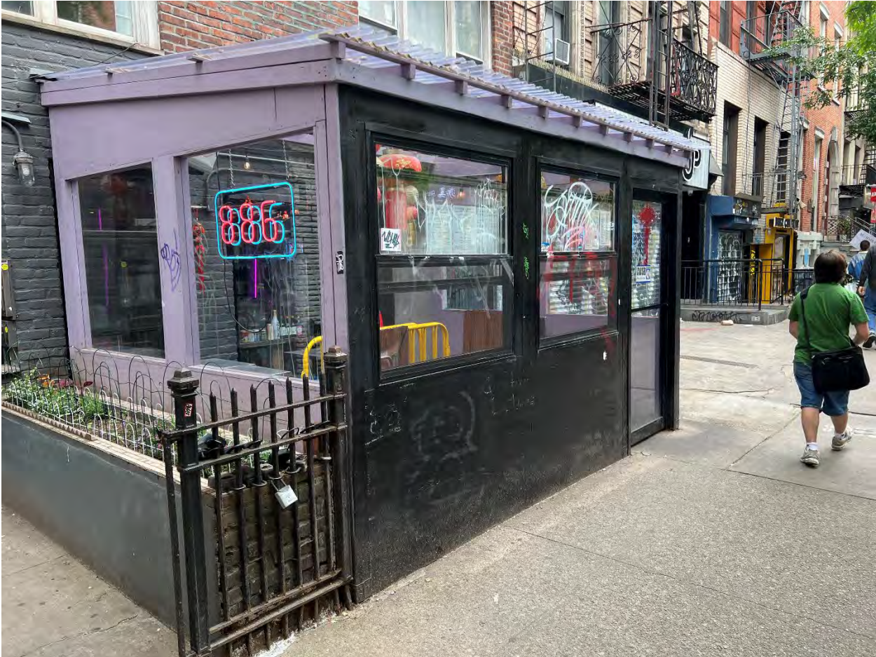
SITE PHOTOS: 886 (20240611010002)