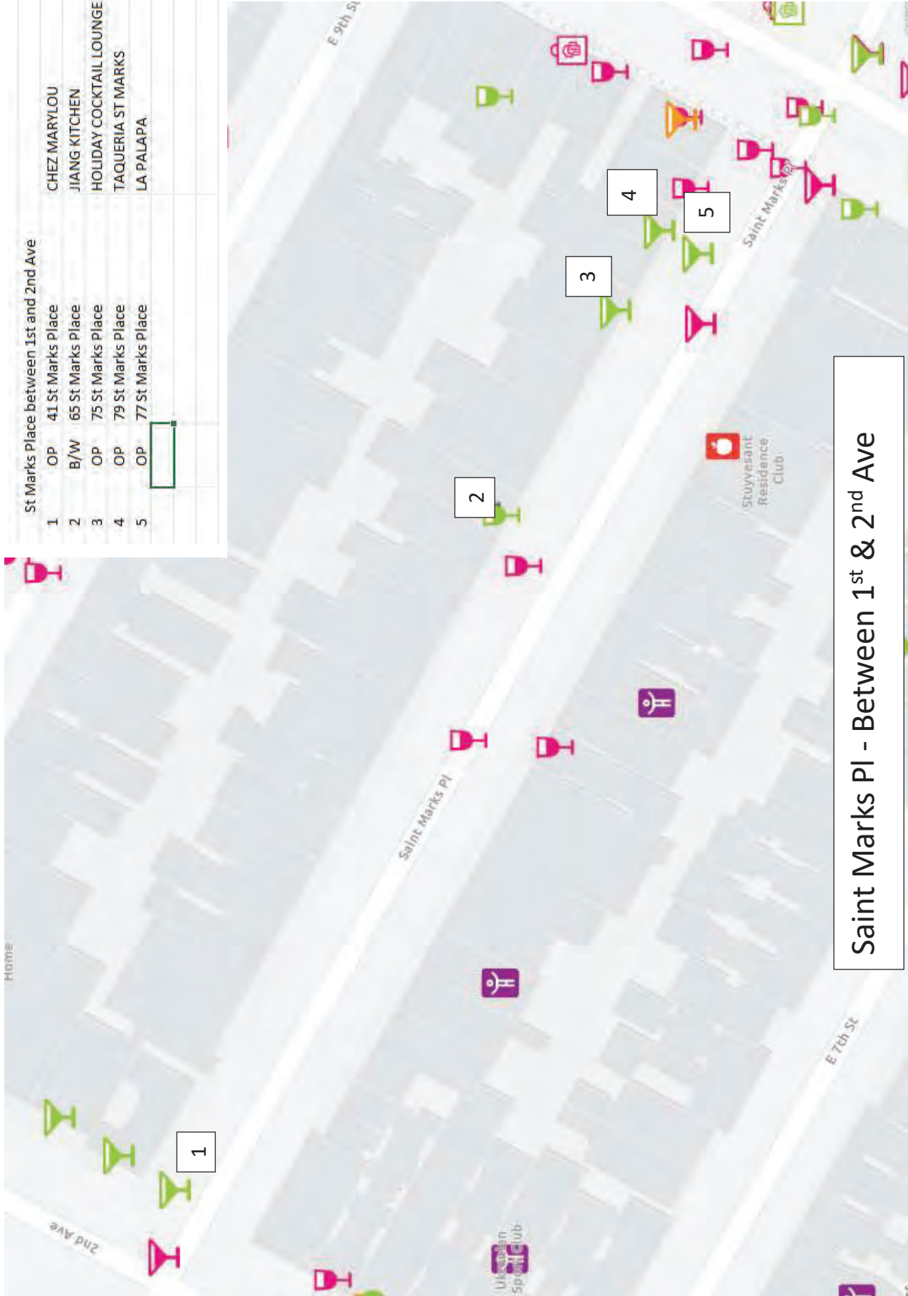
Saint Marks Pl - Between 1 st & 2 nd Ave

CHEZ MARYLOU JIANG KITCHEN HOLIDAY COCKTAIL LOUNGE TAQUERIA ST MARKS LA PALAPA