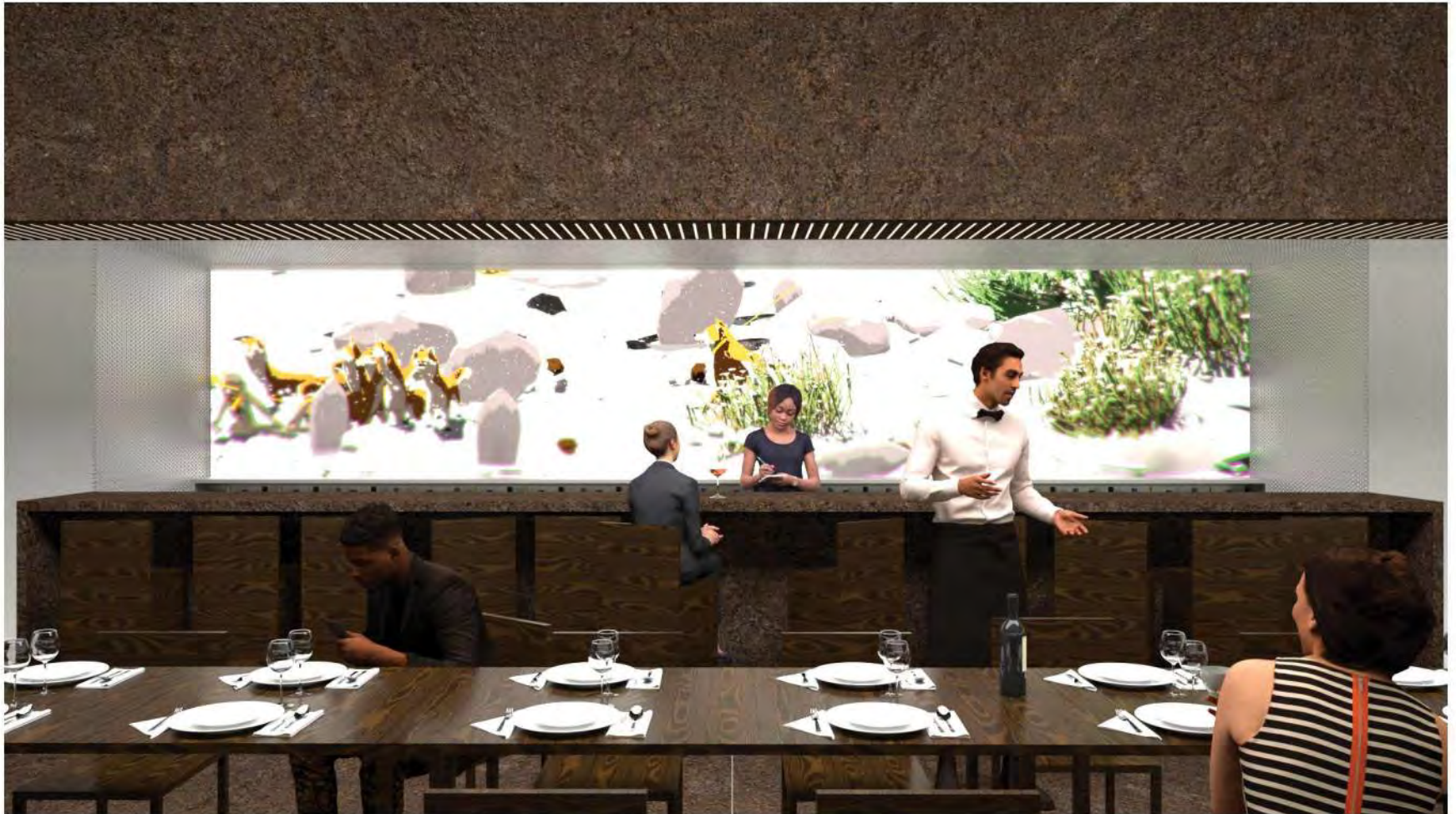
56'' Screen + Low Cupboard