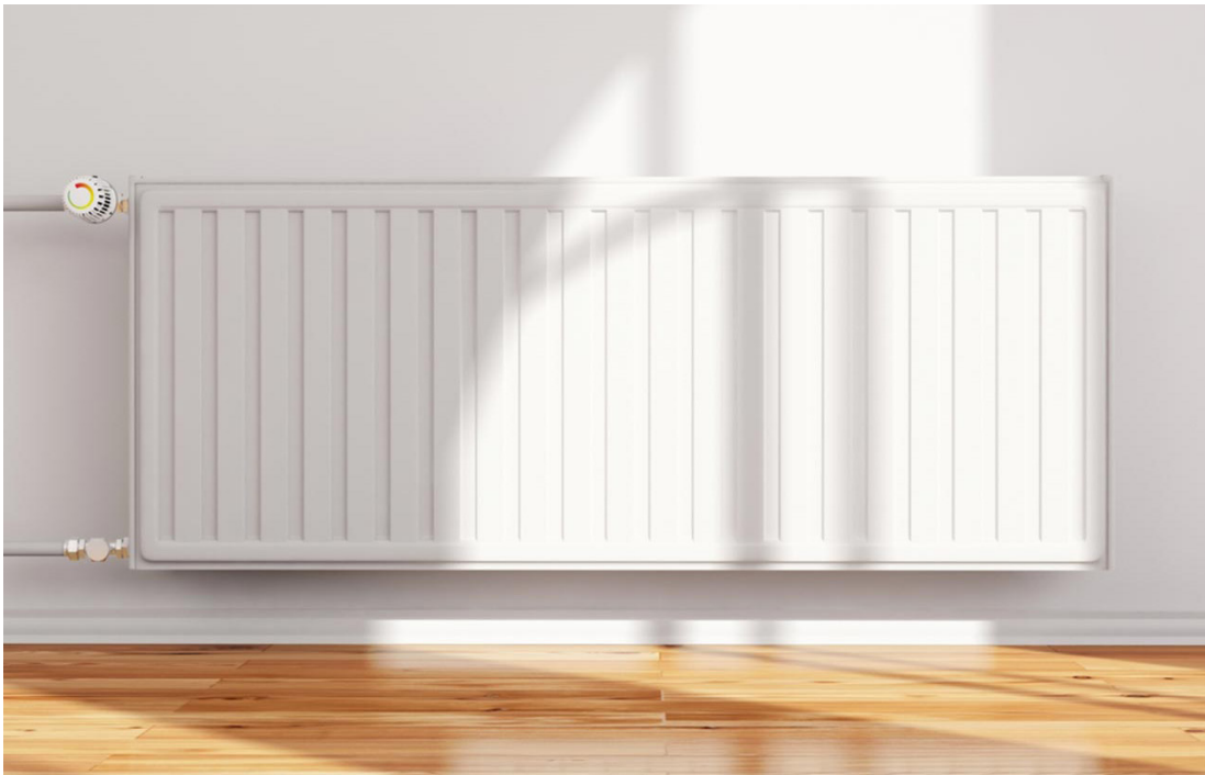
Brendon Harris Hydraulics

*ratings are based on system end use, see back cover for details.