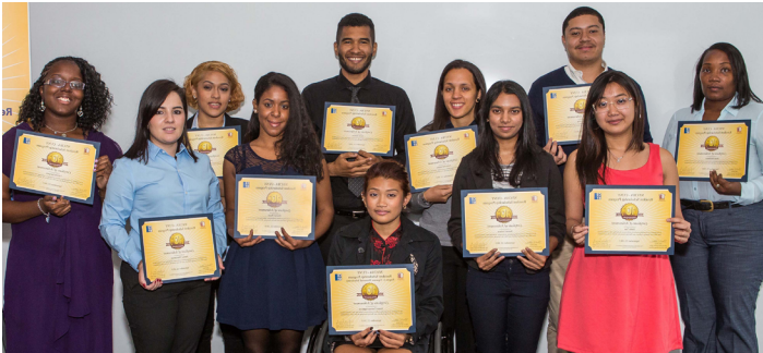
Past NYCHA-CUNY and Regina A. Figueroa memorial scholarship winners.

Ten NYCHA-CUNY students will receive $1,000 scholarships for the 2016-2017 school year. Applicants must be sophomores, juniors, or seniors enrolled in a CUNY associate or baccalaureate degree program and have at least a 3.0 GPA.