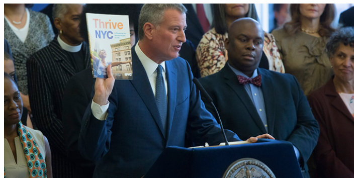
Mayor Bill de Blasio announces ThriveNYC, a comprehensive mental health plan for the City of New York.

Relaxing and sleeping are primary ways to let go of tension. They stop the “fight, flight, or freeze” syndrome. This syndrome describes the three typical ways a person may react to stress: “fight”—feeling agitated or aggressive toward others; “flight”—avoiding or removing oneself from the stressful situation; and “freeze”—an inability to act or move. Relaxing returns the body to normal functioning.