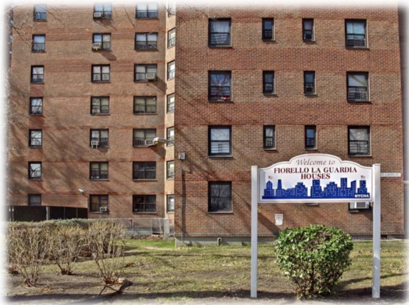
La Guardia Houses

NYCHA and HPD announced release of a Request for Proposals for the development of approximately 450 new mixed-income housing units at La Guardia Houses on the Lower East Side of Manhattan.