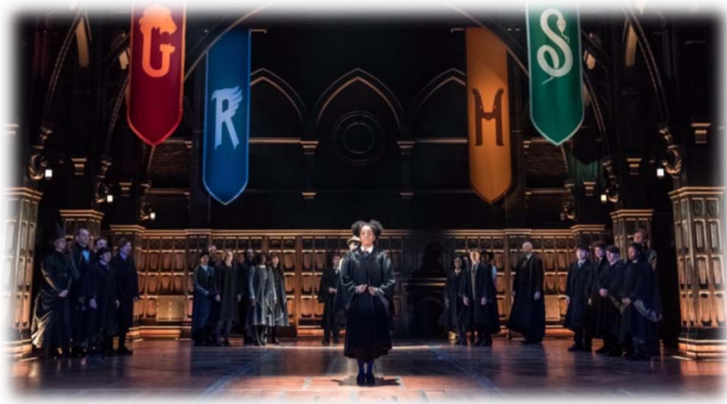
Broadway's Harry Potter and the Cursed Child

In partnership with the Mayor's Office of Media and Entertainment, one hundred NYCHA residents will have the opportunity to see the Broadway Play, Harry Potter and the Cursed Child.