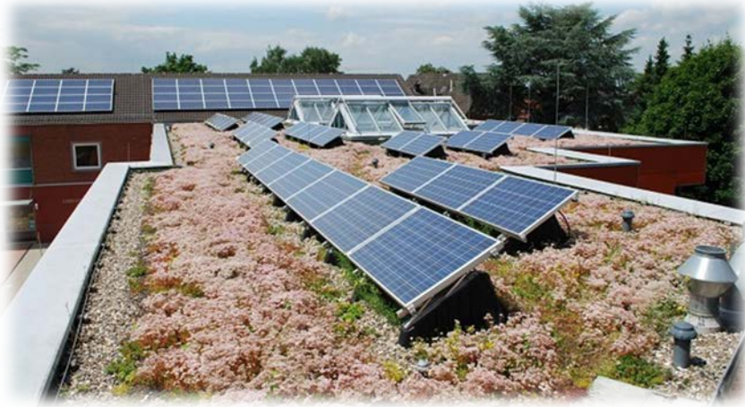
Example Solar Rooftop Garden via Green Roof Technology

The ACCESSolar, ACcelerating Community Empowered Shared Solar, program has started application process for community-based organizations and small solar developers to install community solar gardens on the rooftops of NYCHA buildings.