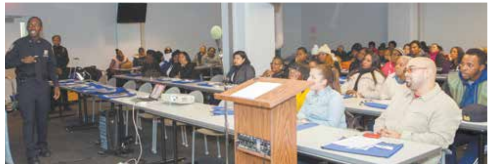
This event was one of the most popular career events that REES has hosted. The next NYPD recruiting fair is scheduled for February 20, 2015.

Following the presentations was a lively discussion session during which attendees asked questions about testing and fee waivers, salary and benefits and eligibility requirements. Each resident received a NYPD tote bag with important information and giveaways. REES will continue to work with the NYPD recruitment team to host similar events throughout 2015.