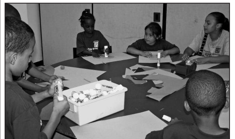
Young OST participants at Alianza Dominicana in Harlem.

OST represents a bold new (Continued on page 6)