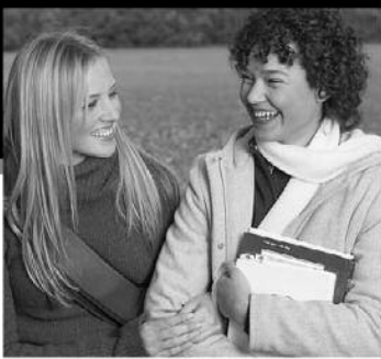
TOP QUALITY EDUCATION

"YOU CAN GO TO COLLEGE THROUGH THE ABILITY-TO-BENEFIT PROGRAM AND GET YOUR GED AT THE SAME TIME YOU EARN A COLLEGE DEGREE"