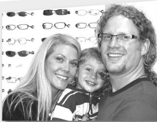
I AM INTERBORO

“Success or failure is entirely based on how serious one is about pursuing their education.”