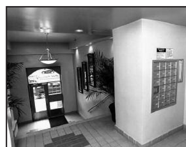
A renovated lobby at University Macombs.

A total of 10% of the units are designated for families that were homeless, and 25% are for former NYCHA residents and other NYCHA referrals. The remaining units are for households earning no more than $42,540, chosen through an HPD lottery.