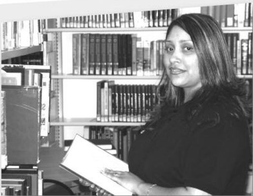
I AM INTERBORO

Interboro Institute, the college where you learn to earn, is an accredited, respected, entry-level college that is completely committed to making your goals happen. Who are we? We'll let some of our students tell you: