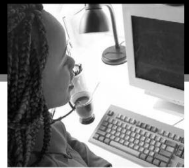
FLEXIBLE SCHEDULES AND ONLINE CLASSES