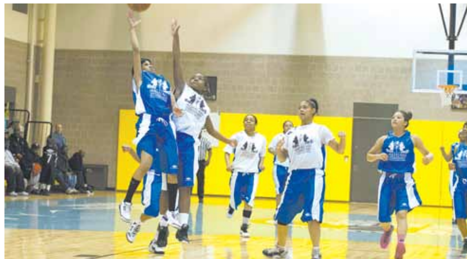
NYCHA youth wear uniforms donated by the hip-hop fashion label ENYCE at NYCHA's annual Citywide Basketball Tournament on May 5, 2012.

This year's tournament kicked off at the Manhattanville Community Center in February, and ended with the championship playoffs at the new Polo Grounds Community Center in Manhattan on May 5. The winning teams in the boys categories were