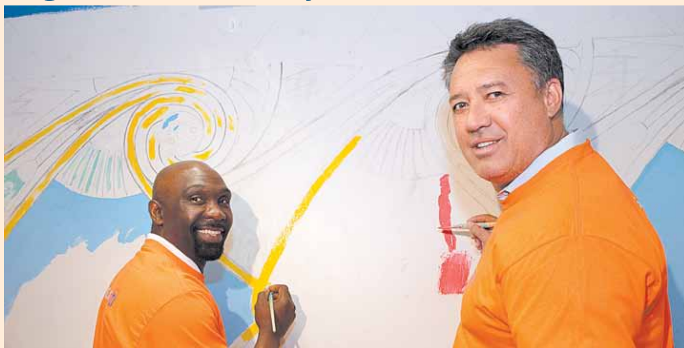
Former Mets Mookie Wilson and Ron Darling help paint the King Towers Community Center at a Brush With Kindness event held by NYCHA, Citi, the New York Mets Alumni Association Presented by Citi and Habitat for Humanity-New York City on May 24, 2012.