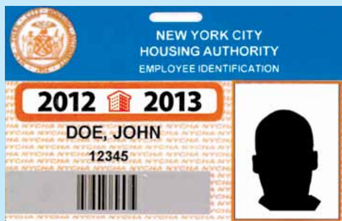
A sample valid and current NYCHA photo identification card.