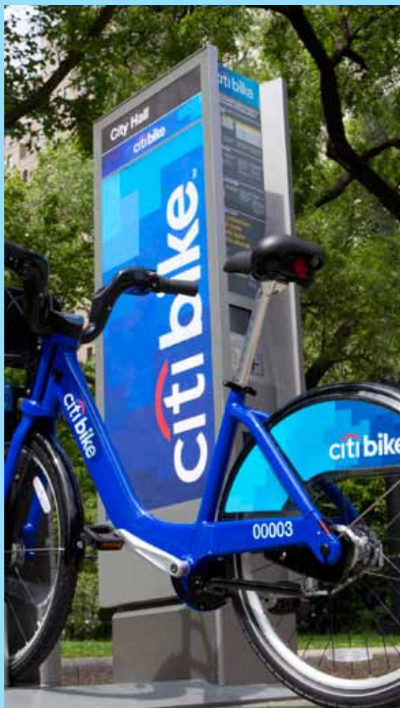
A Citi Bike and kiosk that will be used for New York City's public bike share program.