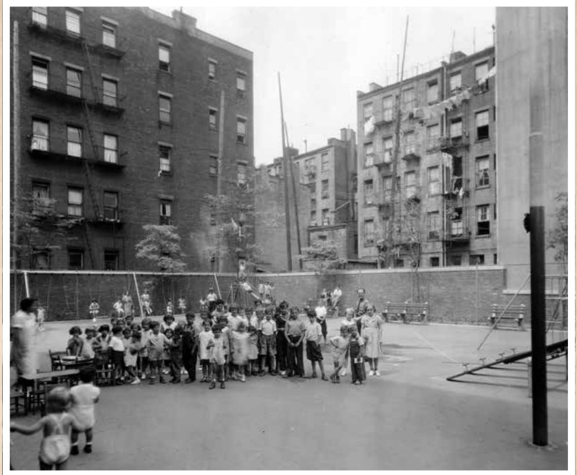
First Houses, 1937