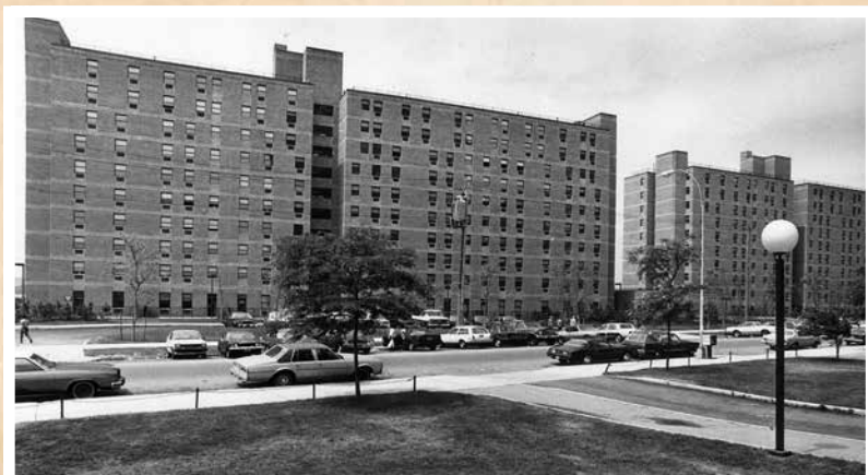
Vandalia Houses, 1983