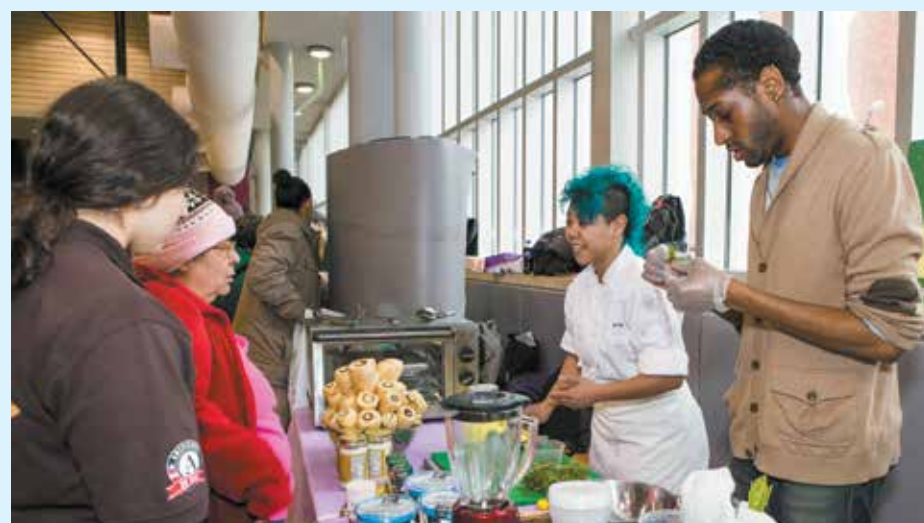
NYCHA residents receive information about healthy eating at the 12th Annual NYCHA Grows with its Gardeners Conference Center on March 14, 2014, at the James Weldon Johnson Community Center.