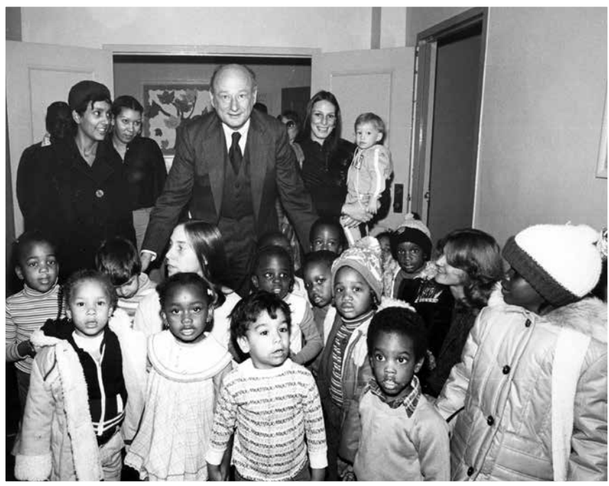
Mayor Ed Koch visits the Breukelen Community Center, 1980