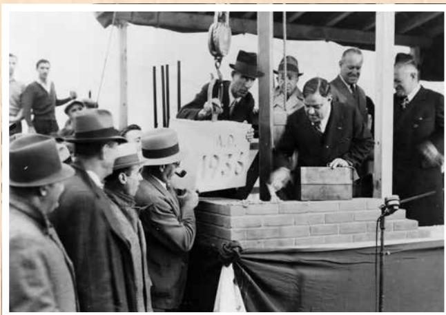
Laying the cornerstone, Williamsburg Houses, 1936