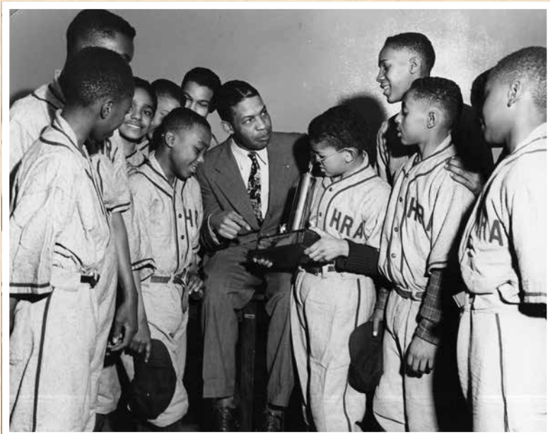
Resident baseball team, Harlem River Community Center, year undetermined