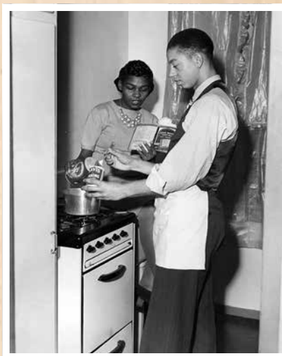
Vladeck Houses, 1940s