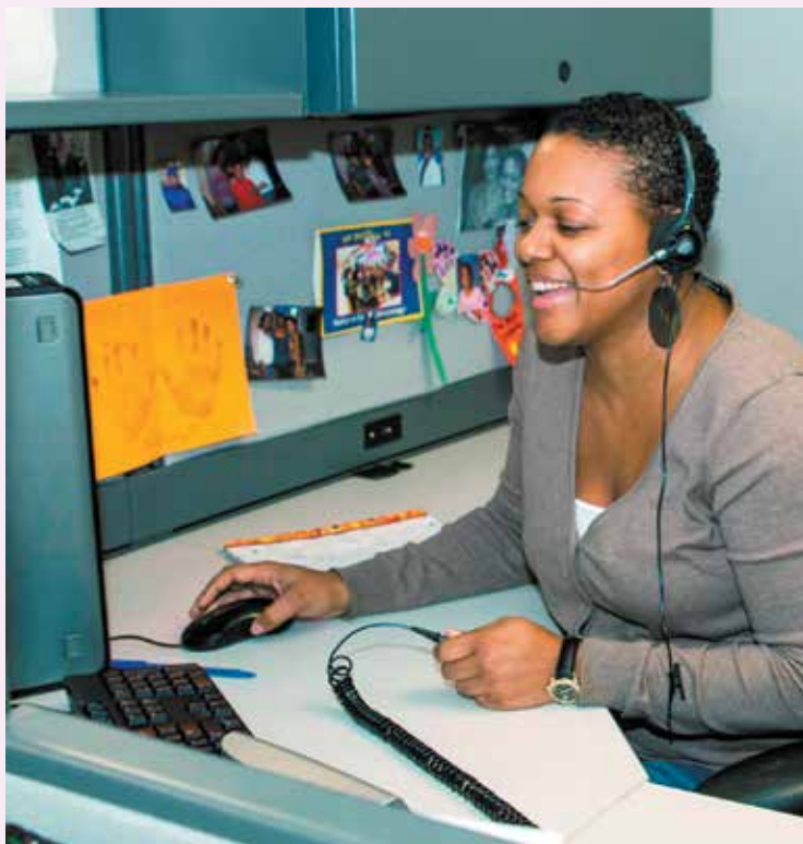
A NYCHA Customer Information Representative at the Customer Call Center speaks with a resident.

Getting through to the correct person when calling NYCHA is getting easier and faster. As part of NYCHA's goal