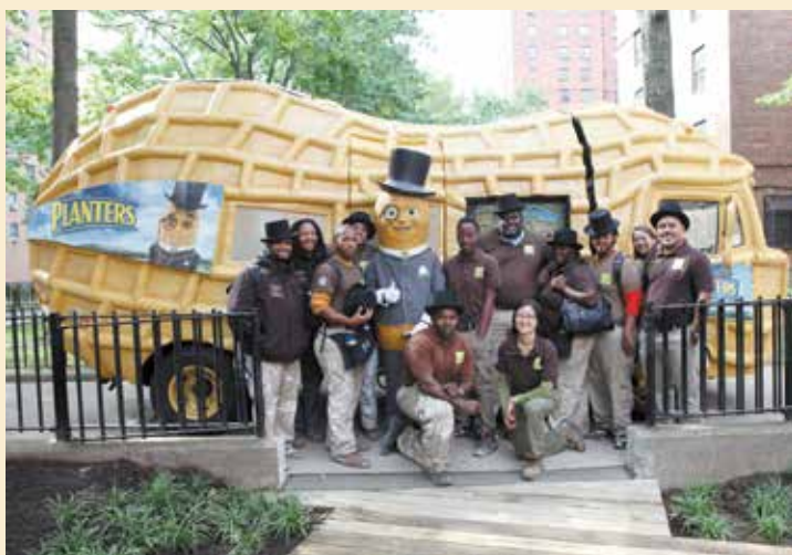
Members of the Green City Force stand with the monocled-one himself, Mr. Peanut, in Planters Grove at Wald Houses.

education, and leadership opportunities in preparation for careers in the energy economy. To date, approximately 180 young NYCHA residents have graduated from this competitive program; 85 percent of graduates are employed or enrolled in college. To apply, register for an information session by calling 718-280-8100 or going online at Opportunitynycha.org . The application period is from March 25 to mid-May.