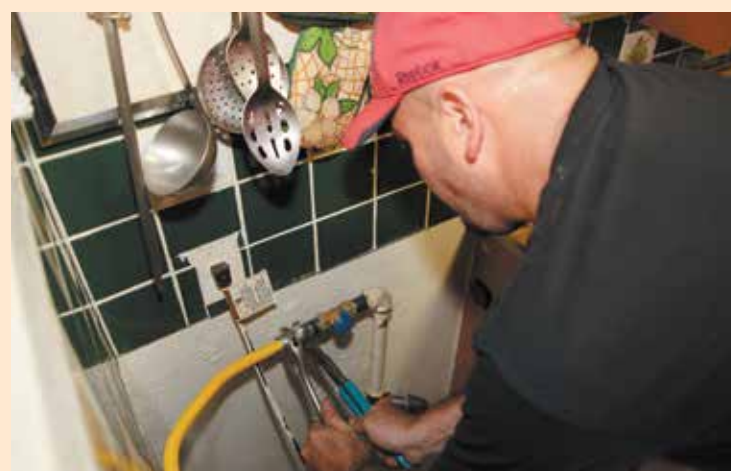
A NYCHA plumber checks a gas line in a resident's kitchen to ensure there is no gas leak.

to get service restored and minimize the inconvenience to residents. However, it takes time to ensure a building is