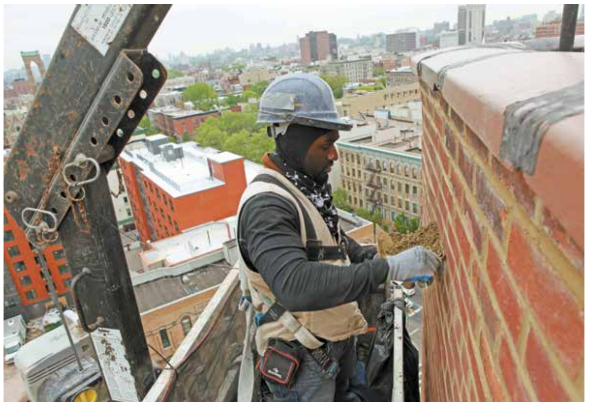
The money NYCHA received from the federal government will be used for capital improvements, including exterior brick work.