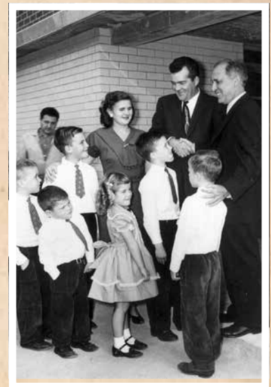
Edgemere Houses, 1960, the first family to move in