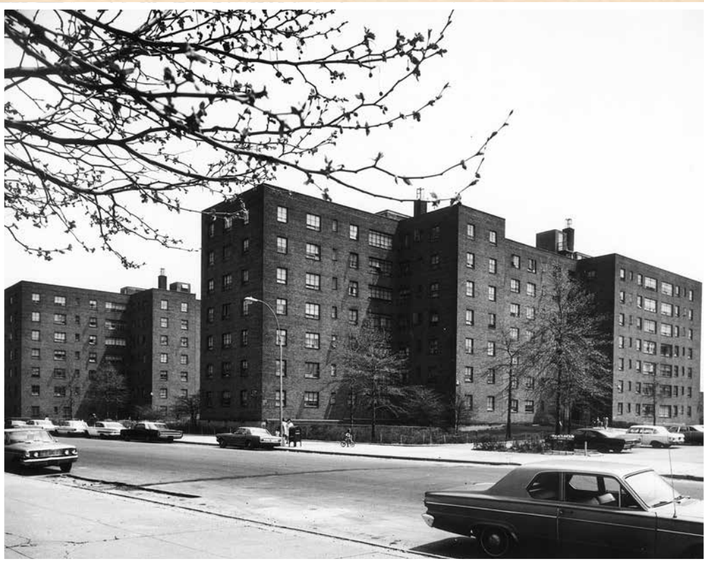
Throggs Neck Houses, 1970