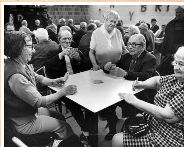
Boston Road (2440) Senior Center, 1974