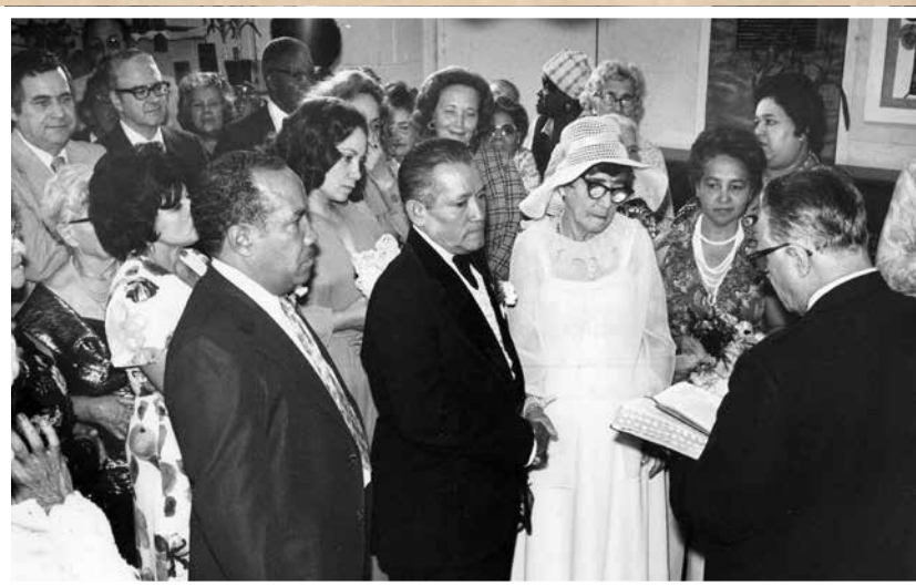
Adams Senior Center, year undetermined

In the March issue of the Journal , we showed photos of NYCHA from the past. In this issue, we are pleased to show you more snapshots of how life was back in the day.