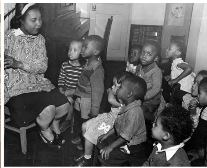
Harlem River Community Center, year undetermined