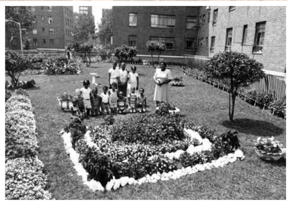
Brevoort Houses, 1979