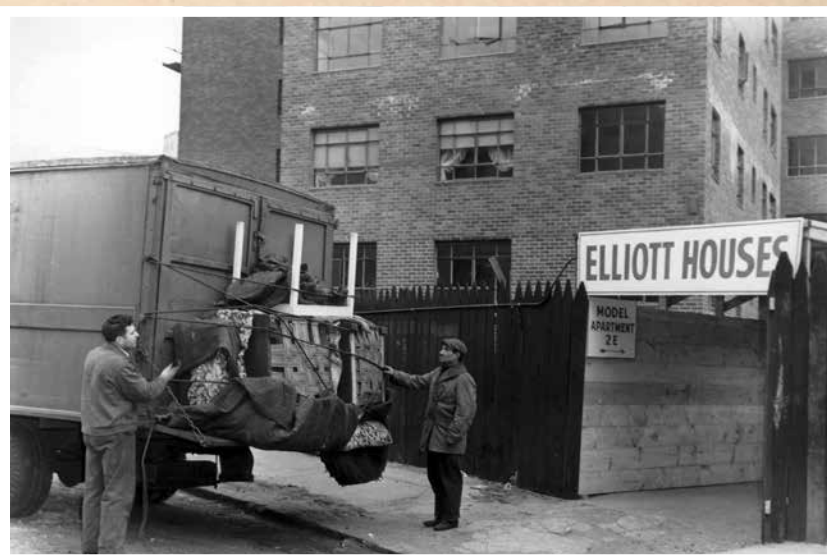
Elliott Houses, 1946