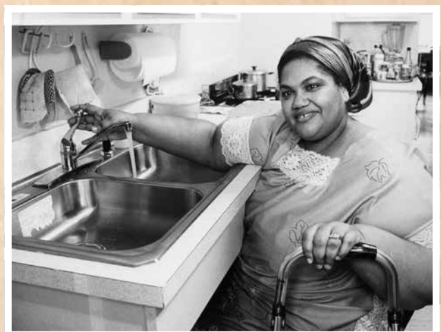
Boston Secor Houses, 1983