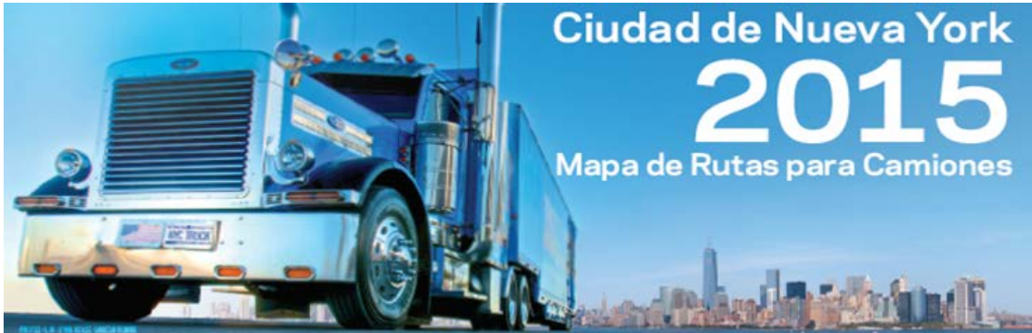
"City of New York Truck Route Map" (Spanish Translation)

Collaborating with the DOT Freight Mobility Unit, DOT’s Language Access Unit put the above into practice and is now finalizing the very first Spanish translation of its Truck Route Map, which is soon to be released. It exemplifies one of DOT’s more extensive document translations expected to reach a larger audience. The lengthy revision process ensures that all stakeholders agree - with the highest level of confidence possible - on the word choices in Spanish and that the translation would be understood by the widest Spanish Limited English Proficient (LEP) audience.