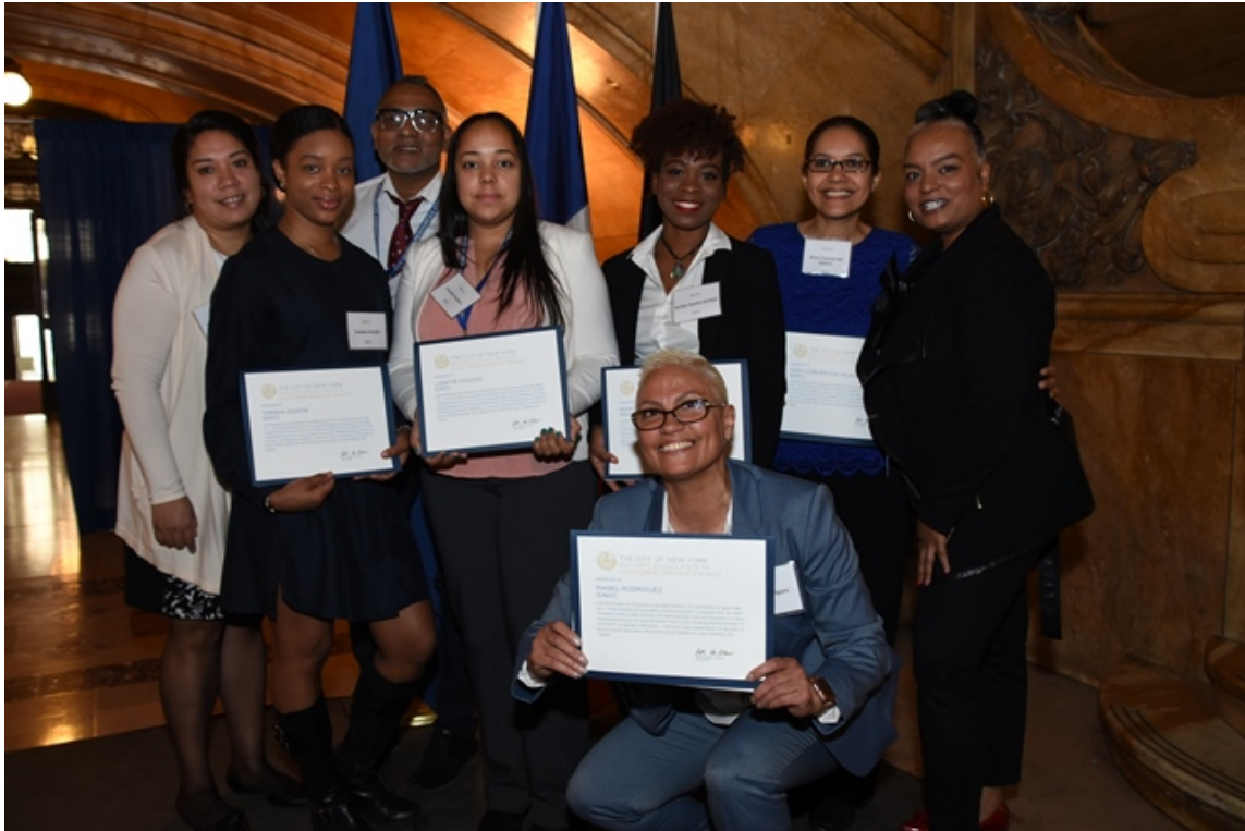
IDNYC honorees proudly display their certificates

The mood was festive as honorees, their supervisors, agency heads and agency customer service liaisons mingled and enjoyed the refreshments while viewing the large screen slide show of honorees and reading the agency honoree bios. Each honoree received a certificate signed by the Mayor. Photos of the 2015 honorees can be viewed on the Office of Operations website .