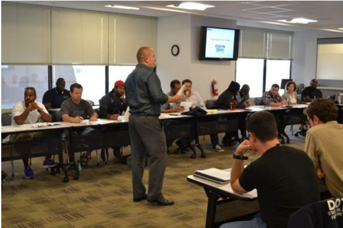
Agency drivers attend fleet safety training

Starting in 2015, DCAS added a fleet driver customer and safety survey as part of this initiative. The survey is available at the time of the course and also online on the NYC Fleet website at DCAS ( go to NYC Fleet ). DCAS is collecting and inputting surveys about Vision Zero from every employee who takes the class, including questions about what types of City vehicles they drive, preferred vehicle safety technologies, fleet services at their agency, and thoughts on fleet safety and the course itself. Participants have submitted nearly 9,000 surveys with more being filled out every day. This is the first time that a customer survey has been implemented for citywide fleet operators.