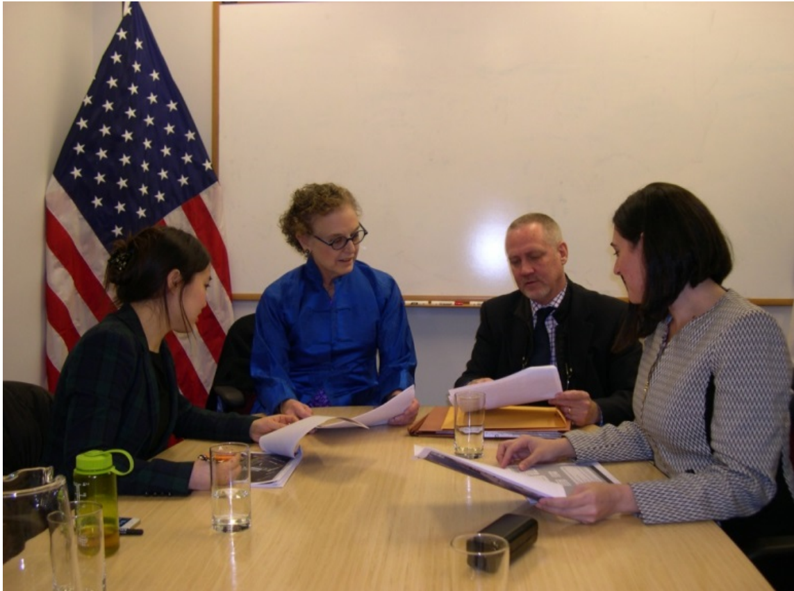
Chinese Interpreter and DOT Project Managers Pre-Meeting at Mayor's Office of International Affairs