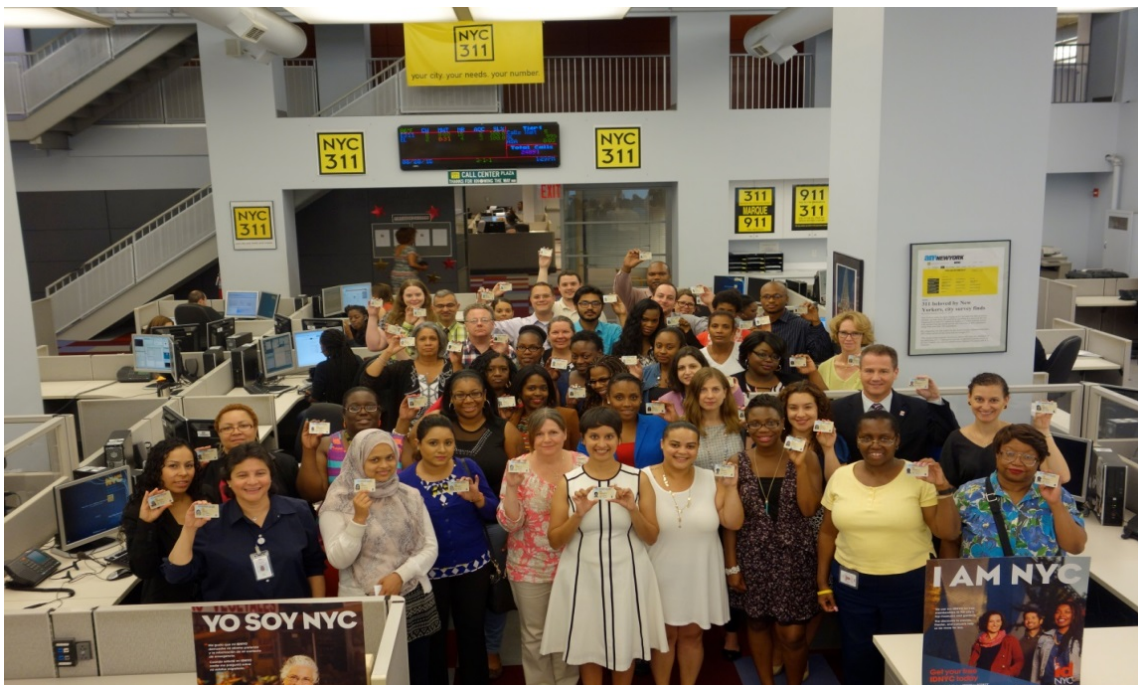
Commissioner Agarwal and members of NYC311 proudly show off their IDNYC cards.

Since the launch of IDNYC in 2014, NYC311 has supported citywide awareness and enrollment efforts. In just one year the NYC311 team handled over 500,000 IDNYC calls. Fifty two percent of those calls were in a language other than English, far surpassing the average rate and highlighting the reach of the IDNYC program. 311 team members continue to schedule appointments, locate enrollment centers and provide information on the IDNYC program on a daily basis to New Yorkers. In August, 2015 Mayor's Office of Immigrant Affairs (MOIA) Commissioner Nisha Agarwal congratulated the NYC311 team for their role in promoting and supporting this initiative.