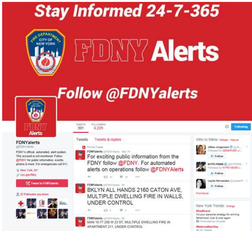
The new @FDNYAlerts Twitter handle shares up-to-the-second updates on fires and emergencies in NYC

“@FDNYAlerts will provide a vital platform to update New Yorkers about the difficult and dangerous work FDNY members perform 24-hours a day,” said Commissioner Nigro. “We will continue to use every tool at our disposal – from presentations at community events to social media – to inform, educate and improve the safety of all New Yorkers.”