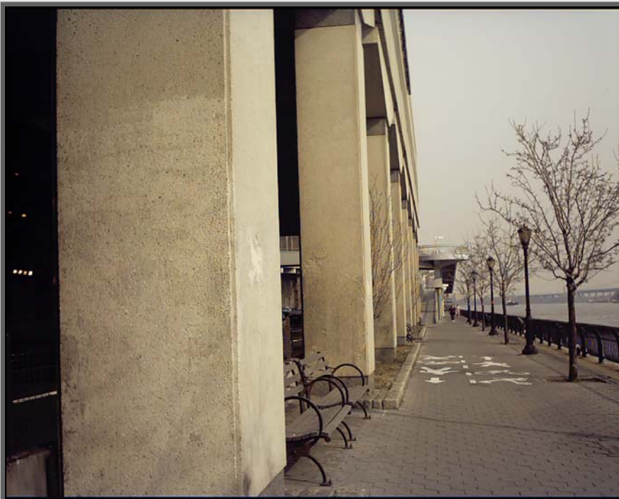
2. View looking north along the esplanade showing footing columns for the East Wing.