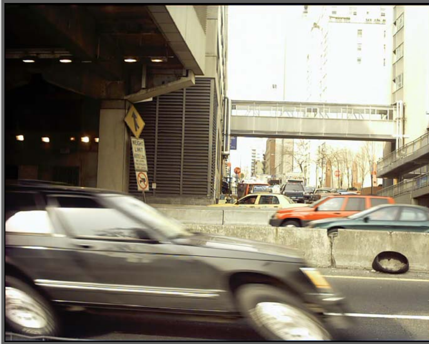
13. View looking west across FDR Drive at the bridge connecting HSS.