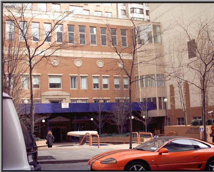
14. View of the Belaire plaza and building.