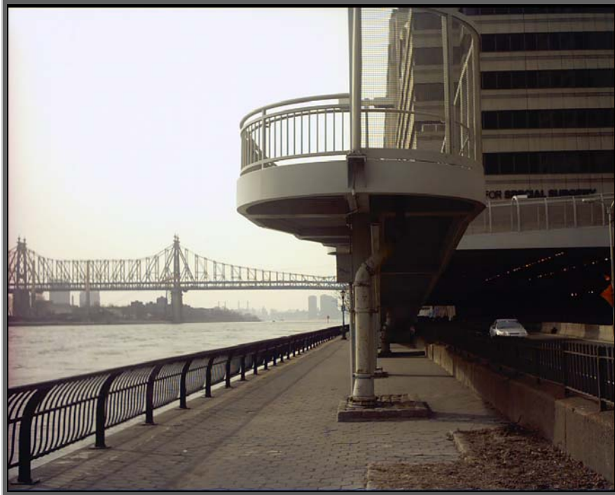
3. View looking south along the esplanade.