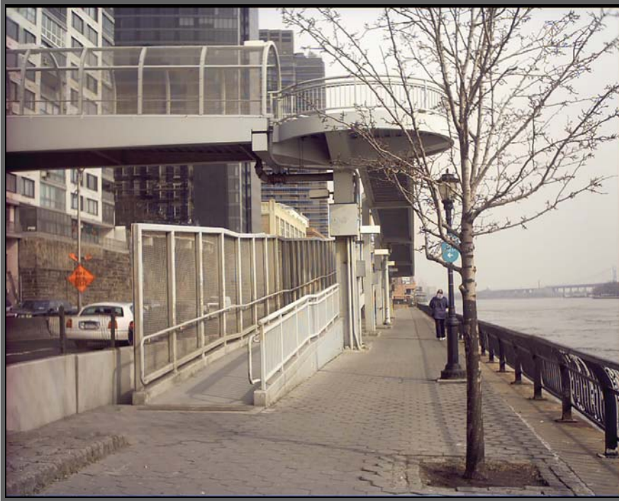
1. View looking north along the esplanade.