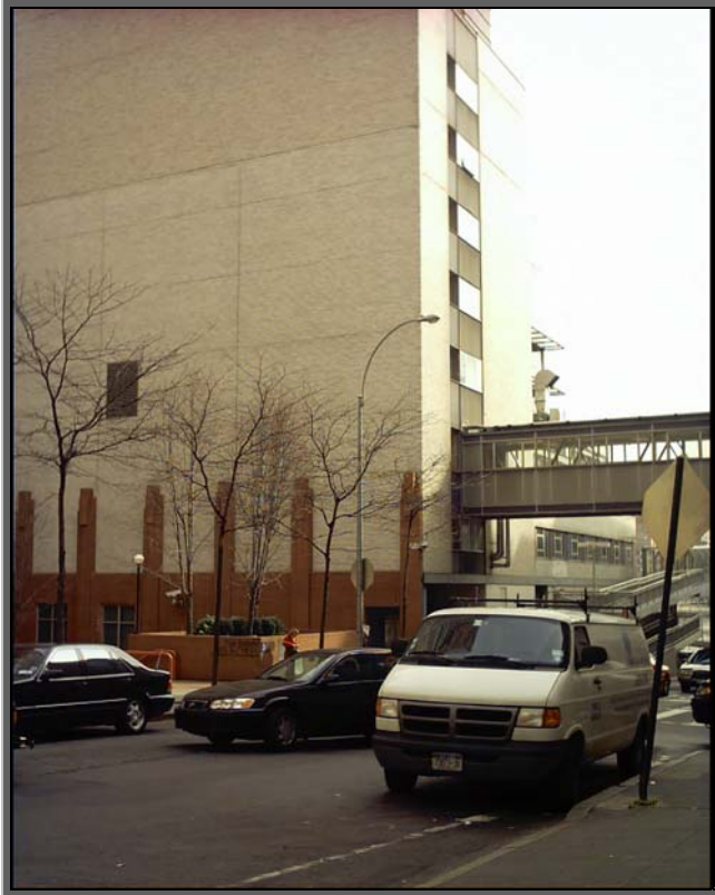
21. View of the bridge connecting HSS over E. 71 st Street.