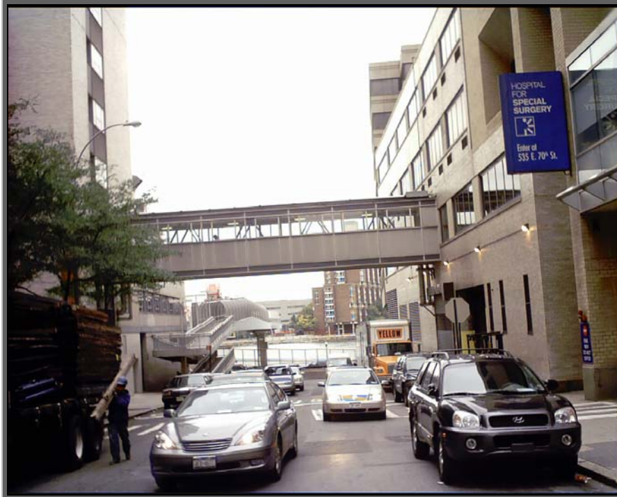
11. View looking east along East 71 st Street from midblock between York Avenue and the FDR Drive showing the existing pedestrian bridge between the West Wing and the Caspary Building.