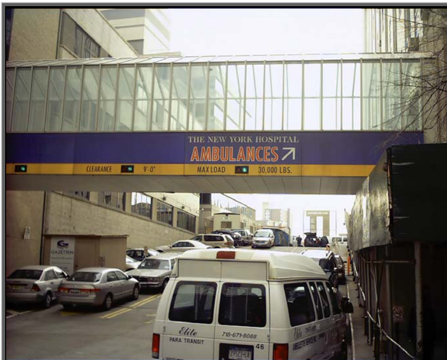
12. View looking east along East 70 th Street showing the existing pedestrian bridge between the West Wing and New York Presbyterian Hospital.