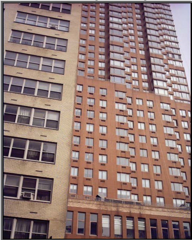
22. View of the Belaire Building facing North.