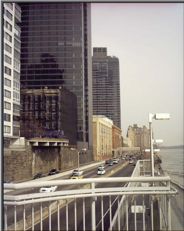
6. View looking north along the FDR Drive from the public pedestrian bridge.