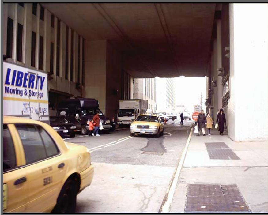
15. View of the NYPH building over East 70 th Street.