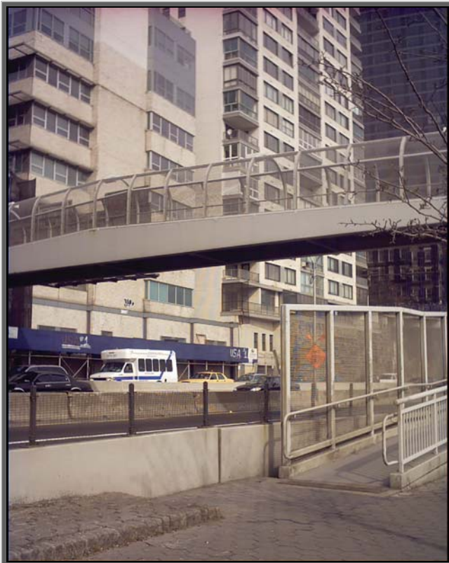
16. View of the pedestrian bridge over FDR Drive.