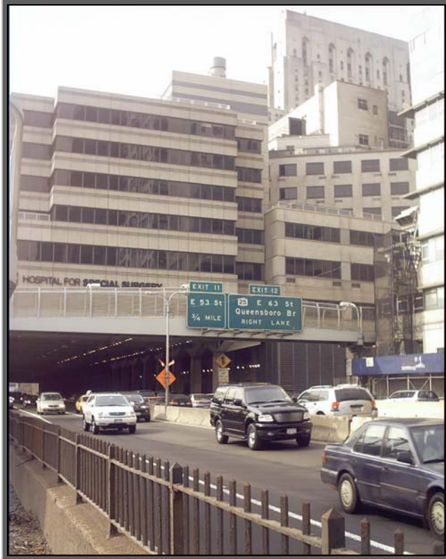
17. View of the Pedestrian bridge and HSS Main Hospital-East Wing over FDR.