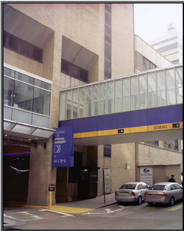
24. View of the bridge connecting HSS and NYPH on E. 70 th Street.