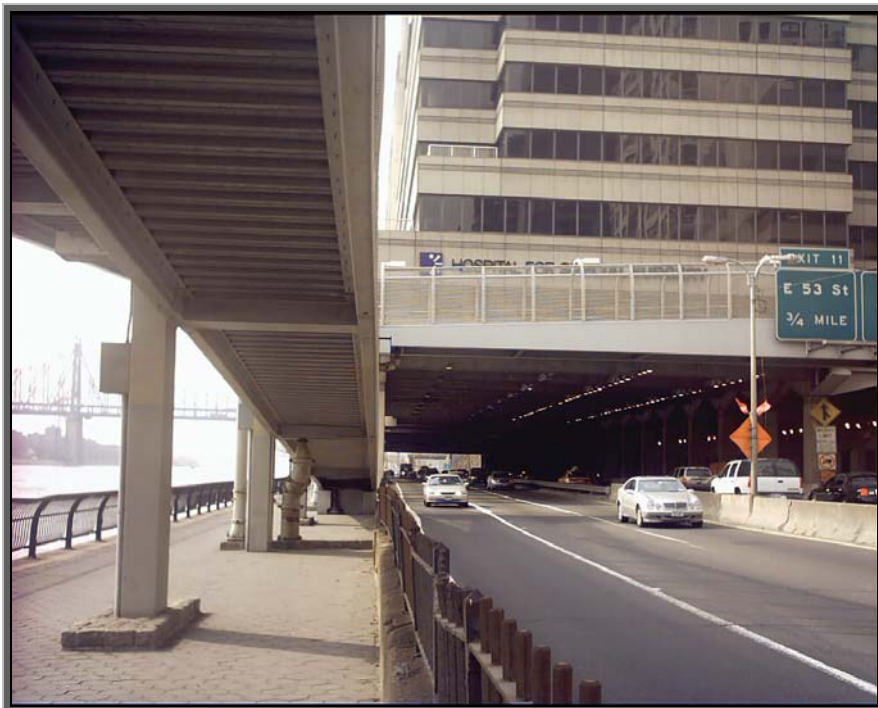
4. Another view looking south along the esplanade.