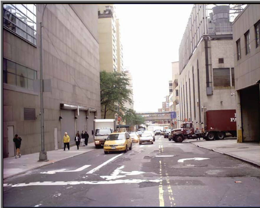
10. View looking east along East 71 st Street from York Avenue showing the existing pedestrian bridge between the West Wing and the Caspary Building.