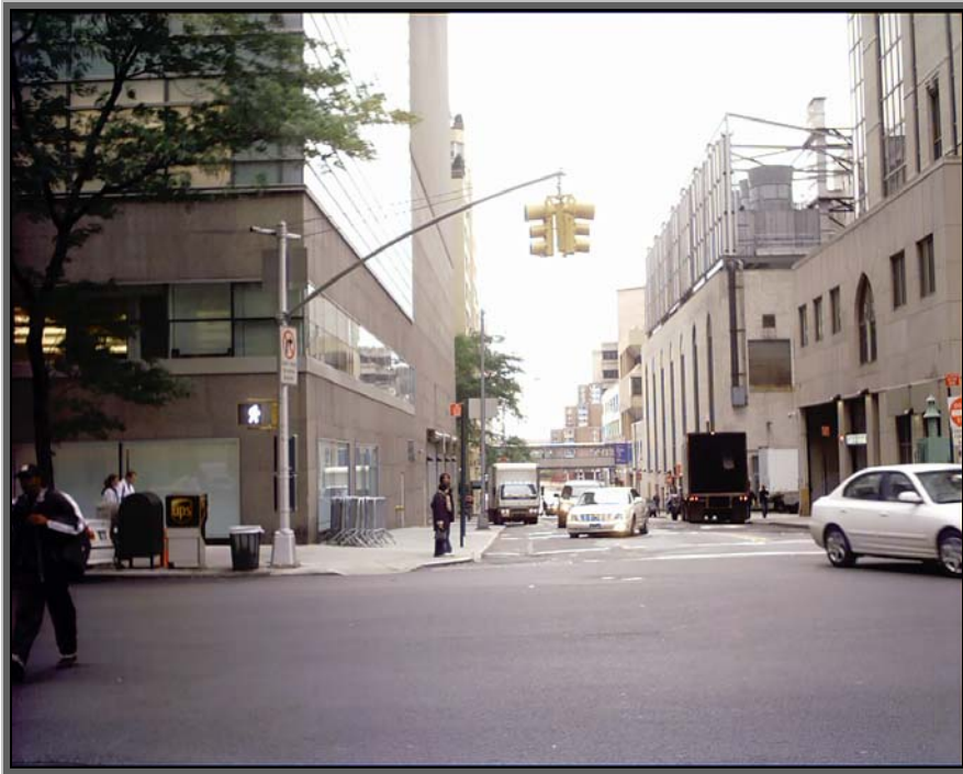
25. View of E. 71 st Street from York Avenue facing East.