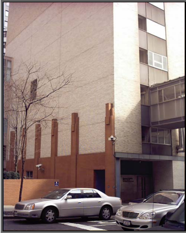
23. View of the Caspary Building of HSS.