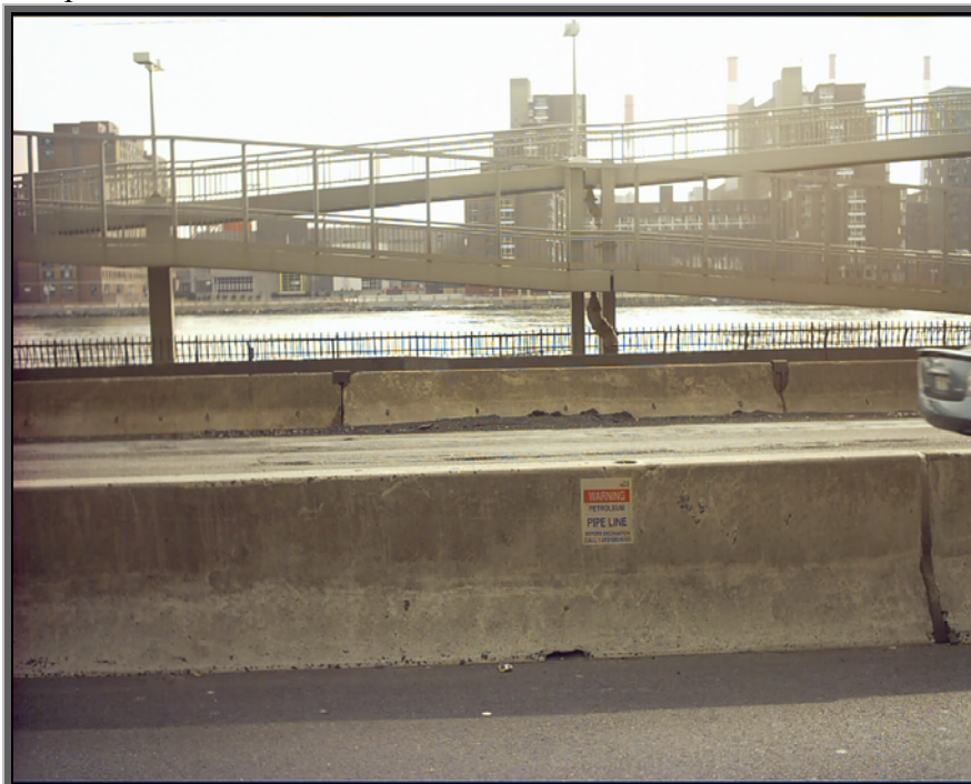
8. View looking east from the location of the proposed River Building on the FDR Drive between E. 71 st Street and E. 72 nd Street