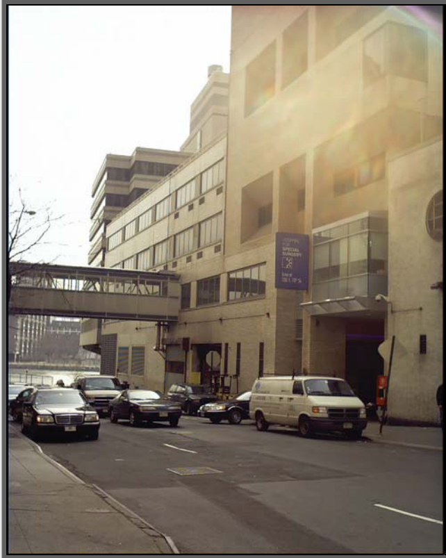
19. View of the bridge connecting HSS on E. 71 st Street.