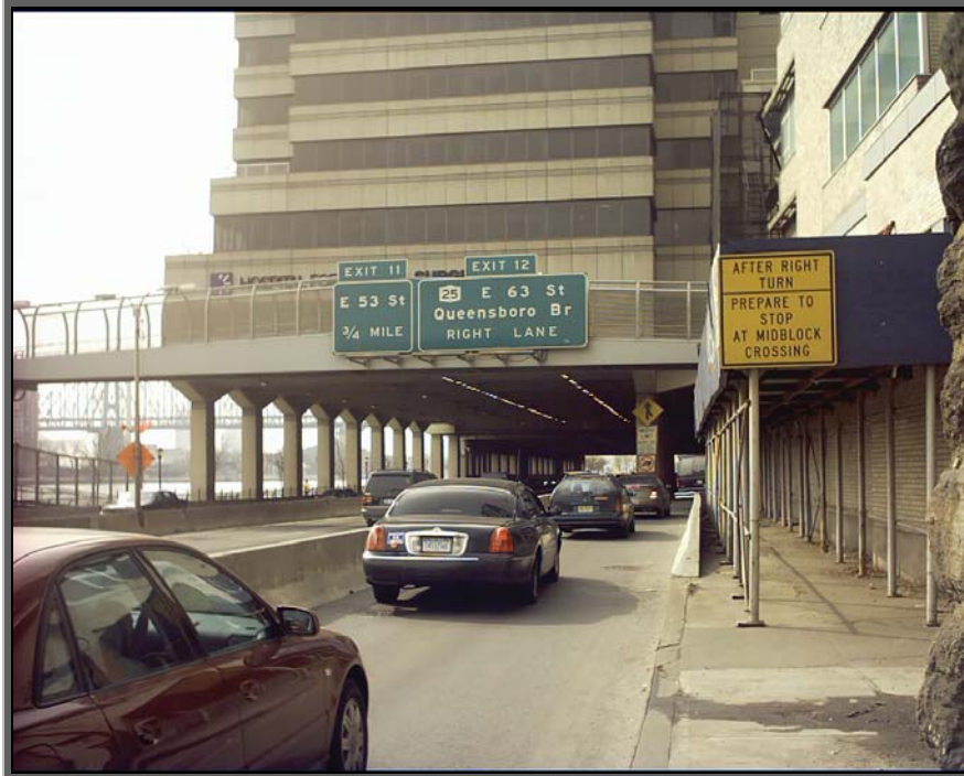
7. View looking south along the FDR Drive at the East Wing and at the public pedestrian bridge that provides waterfront access.