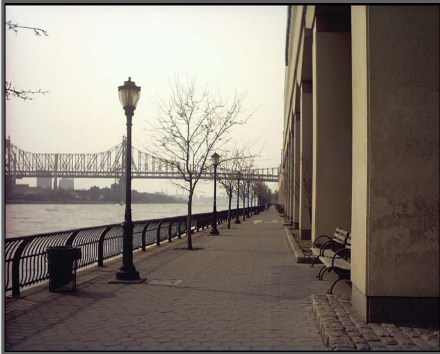
5. View looking south along the esplanade showing footing columns for the East Wing.