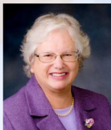
Senator Toby Stavisky