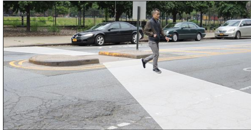
Before Conditions: Bay St