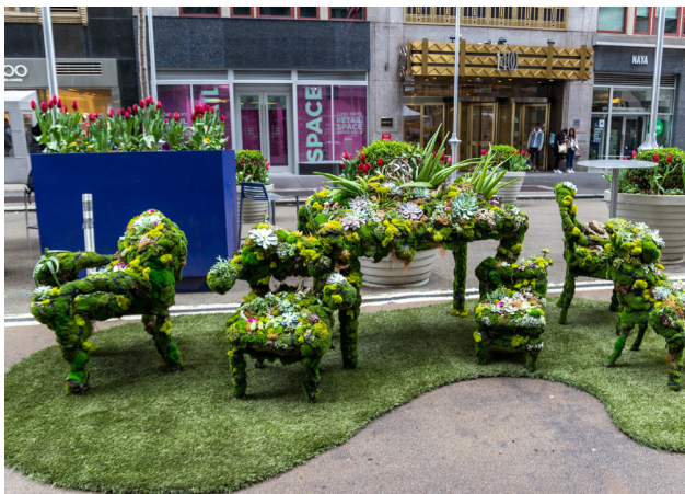
Natalie Collette Wood EcoHarmony , 2024 Broadway between West 38th Street and West 39th Street, Manhattan