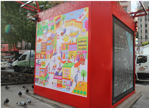
Welcome to Chinatown – Chinatown Walk by Dingding Hu, 2017 Chinatown Kiosk