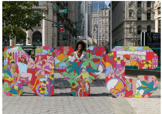
NYC Art Stop Letters by Ebony Bolt, 2022 Summer Streets event routes