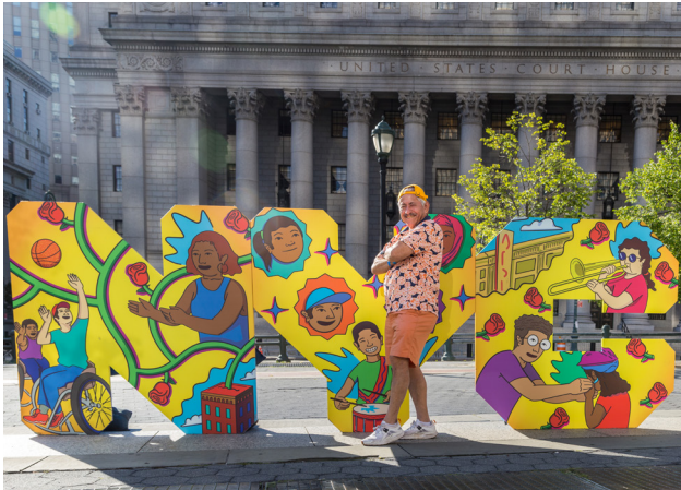
NYC Art Stop Letters by Angel Garcia, 2023 Summer Streets event routes