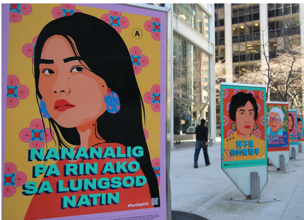
I Still Believe in Our City by Amanda Phingbodhipakkiya, 2021 NYC DOT Art Display Cases