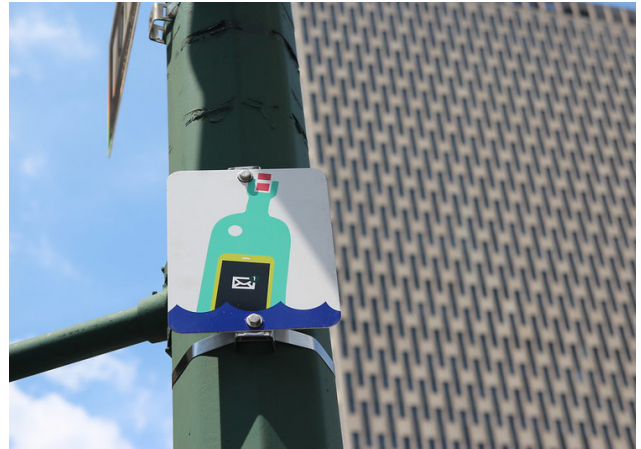
ICY SIGNS by Steve Powers, 2015 Summer Streets event routes