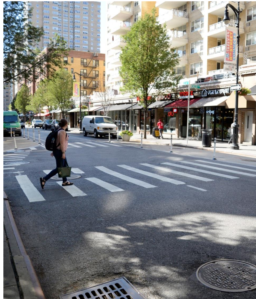
Enhanced Crossing, 8 th St, Manhattan, NYC