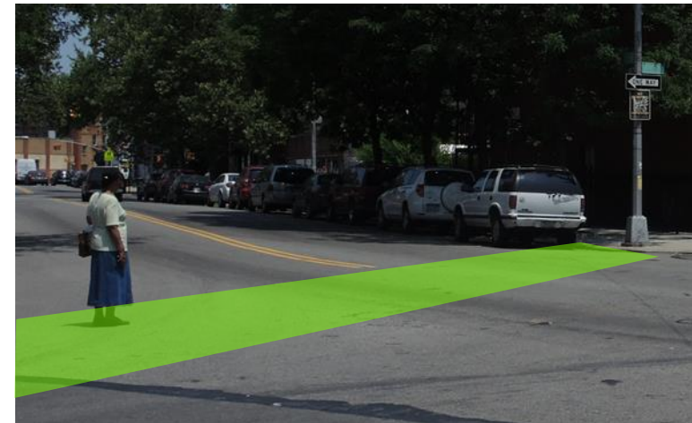
Pedestrian Crossing, Brooklyn