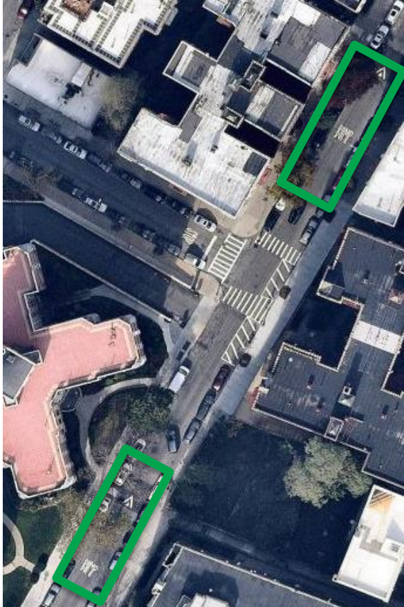
Speed humps before and after enhanced crossings on Cabrini Blvd at W 186 th St, Manhattan

Where possible, additional traffic calming, such as: speed humps, pedestrian refuge islands or neckdowns are included with each crossing