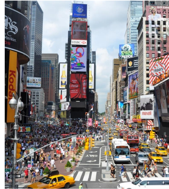
Times Square, Manhattan