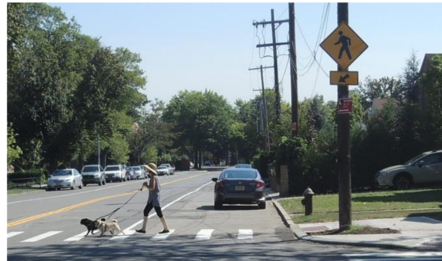
3 d Ave at Francis Lewis Park, Whitestone, Queens