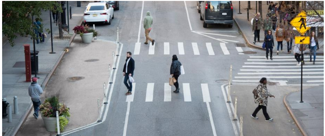
Neckdowns, 8th St, Manhattan