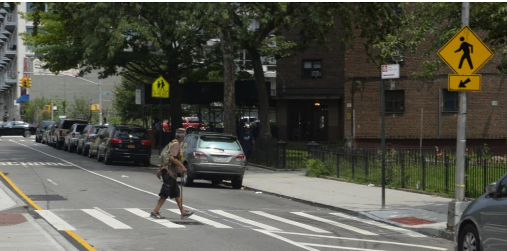
Gold St, Brooklyn