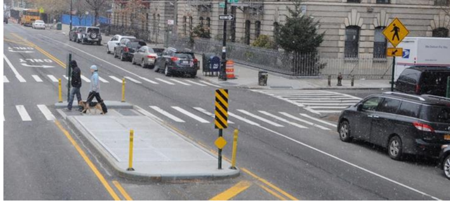
Concrete refuge island, Morningside Ave, Manhattan