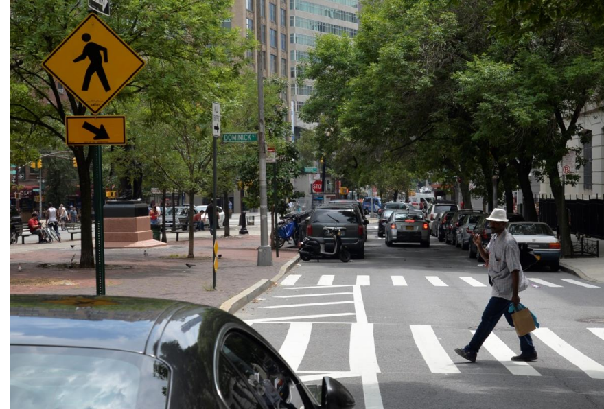
Little 6 th Ave and Dominick St, Manhattan