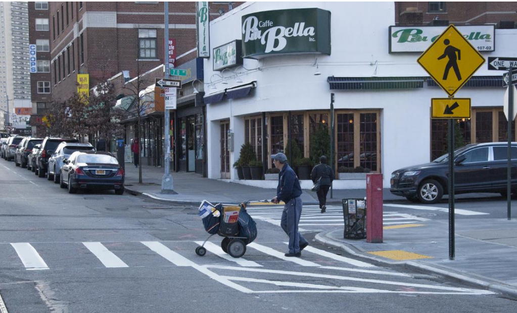
Queens Blvd Service Rd at MacDonal Park, Queens