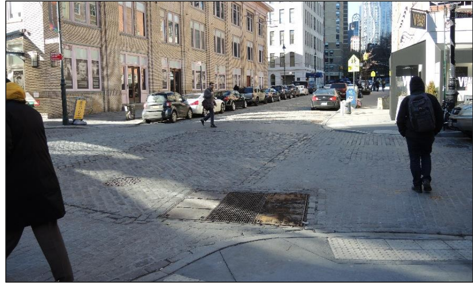
Before: Beekman and Front St