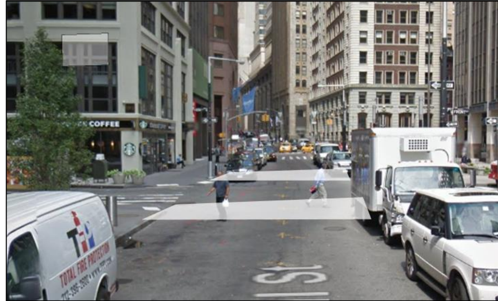
Before: Wall and Front St