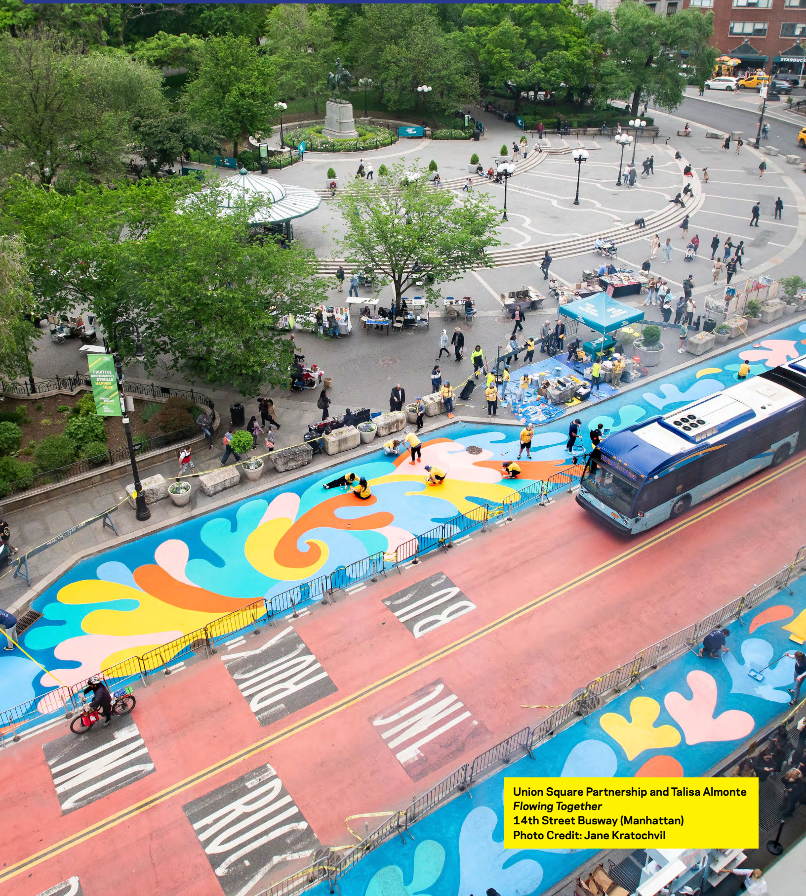
Union Square Partnership and Talisa Almonte Flowing Together 14th Street Busway (Manhattan)