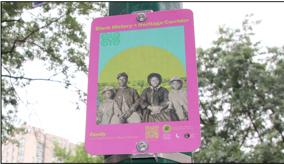
Streetlight Pole Creative Alchemy, GrowHouse, and Ifeoma Ebo