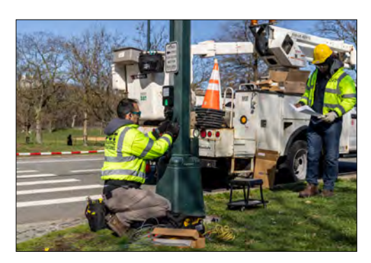
Above: A DOT employee installs an APS pushbutton. Right: A person who is blind uses an APS pushbutton before entering a crosswalk.