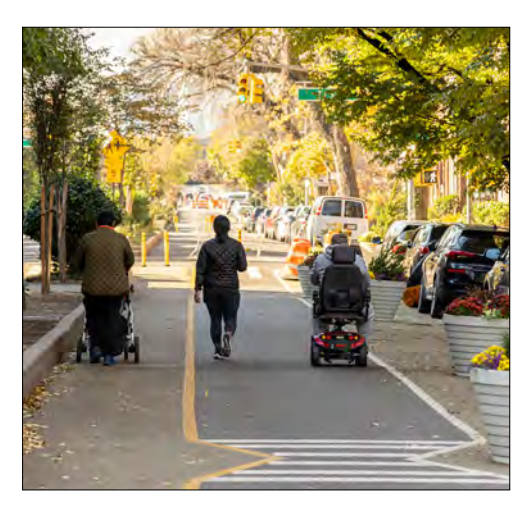
Above: 34th Avenue, Queens Right: Vanderbilt Avenue, Brooklyn

New York City's Open Streets program transforms streets into public space open to all. These transformations allow for a range of activities that promote economic development, support schools, facilitate pedestrian and bike mobility, and provide new ways for New Yorkers to enjoy cultural programming and build community. There are three types of Open Streets: limited local access, full closure, and full closure: schools. Recognizing the need for design upgrades to enhance operations and accessibility for those with disabilities, a primary program focus for NYC DOT is reimagining streets as public space. The agency is committing to enhancing walking, biking, and public transit on New York City Open Street corridors, including adding accessibility upgrades and considerations. NYC DOT has a large transportation and design tool kit that allows the agency to deliver on this vision for Open Streets. NYC DOT will conduct observational analyses, user surveys, traffic counts, and engage with stakeholders to enhance the accessibility of Open Streets.