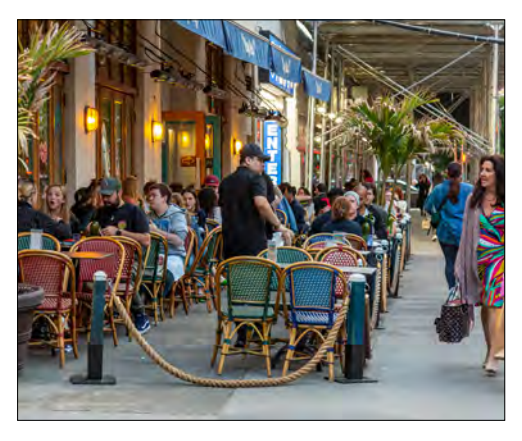
Above: Amsterdam Avenue, Manhattan Right: John Street, Manhattan

Amid the challenges posed by the pandemic, the temporary outdoor dining program played a crucial role in expanding dining opportunities, allowing small businesses to remain open during the shutdown. The temporary program expanded outdoor dining participation by approximately tenfold over the pre-pandemic participation rate and allowed outdoor dining citywide for the first time. Building on lessons learned from the temporary program, NYC DOT is strengthening accessibility and safety requirements to address quality of life concerns. The proposed rules for the permanent program include key accessibility measures that ensure all setups will meet ADA and NYC Department of Buildings (DOB) requirements. For instance, ADA accessible ramps will be required for roadway setups that are not flush with the curb. Both sidewalk and roadway setups require at least one accessible seat and must maintain a clear path on the sidewalk beyond the 36-inch minimum. The permanent program is expected to launch in February 2024 ushering in more accessible, safer setups for the 2024 outdoor dining season.