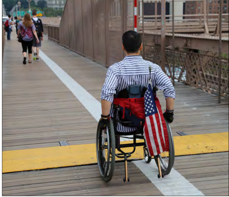
Brooklyn Bridge pedestrian path