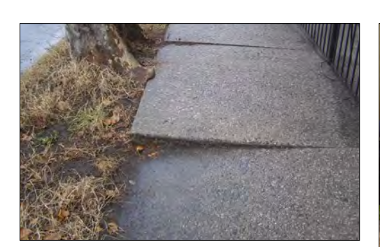
Left: Example of uneven surfaces along a sidewalk. Right: Sidewalk improvements remove obstacles for people with disabilities.

The sidewalk program's goal is to enhance safety and accessibility by repairing defective conditions throughout the city's network of over 12,000 miles of sidewalk. These defects, including cracks, holes, uneven surfaces, improper slopes, or collapsed concrete, may pose hazards to pedestrians and people with disabilities. The program operates on a complaint-driven basis, where received complaints prompt staff to inspect sidewalks and issue Notices of Sidewalk Violation to property owners who are responsible for necessary repairs. In the event timely repairs are not made by the property owner, the agency may hire private construction firms to make the repairs. When this happens, NYC DOT bills the property owner for the cost of the repairs. The agency replaces over one million square feet of sidewalk annually, with a focus on cityowned property and residential neighborhoods.