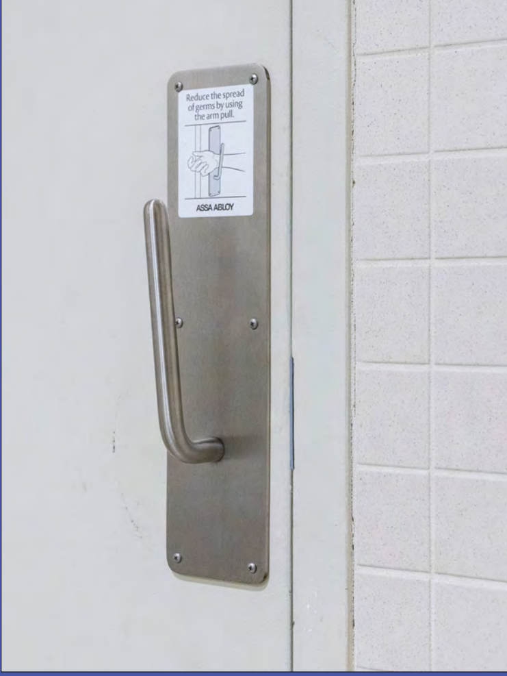
Automatic door opener and accessible bathroom door handle installed at 55 Water Street.