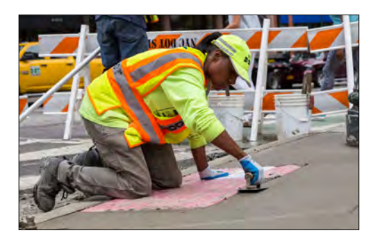
Above: A DOT employee installs a new pedestrian ramp. Right: A person in a wheelchair enters a sidewalk via a pedestrian ramp.

The agency's Pedestrian Ramp Unit performs the important work of upgrading the city's pedestrian ramps to create safe and accessible pathways to our sidewalk network. Common issues include obstructions, poor location, and non-compliance with accessibility standards. With a wide-ranging scope that includes the assessment of corners, medians, and mid-block crossings, the unit manages the planning, budgeting, and granting approvals for pedestrian ramp installations and makes upgrades in compliance with the ADA. A 2019 settlement mandated NYC DOT to survey and repair pedestrian ramps in need of accessibility upgrades across all five boroughs. All new and upgraded pedestrian ramps adhere to the latest ADA standards, featuring detectable warning surfaces designed with contrasting colors to assist people who are blind or have low vision. From July 2022 through June 2023, the pedestrian ramp unit successfully constructed over 6,600 pedestrian ramps, further enhancing accessibility and inclusivity throughout our city. Hundreds more ramps are upgraded each year through street reconstruction projects. Over the next five years, the program will continue to install many new and upgraded accessible pedestrian ramps across the city to make pathways along our sidewalk network more accessible for people with disabilities.