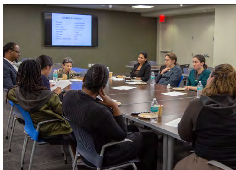
Left: NYC DOT at the African American Day Parade Right: NYC DOT employees attending an ERG meeting