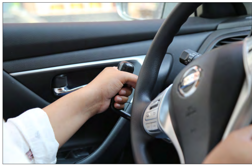
Left: Designated parking spot reserved for carshare Above: Hand control inside a carshare fleet vehicle