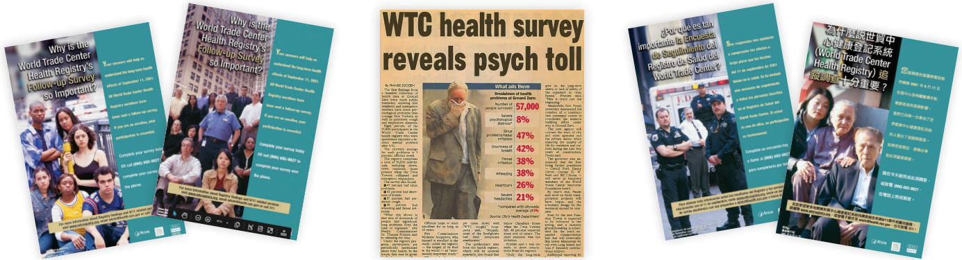
New York Post, November 23, 2004

After 9/11, there were concerns about the potential short- and long-term health effects of the disaster due to exposure to environmental toxins and witnessing traumatic events.