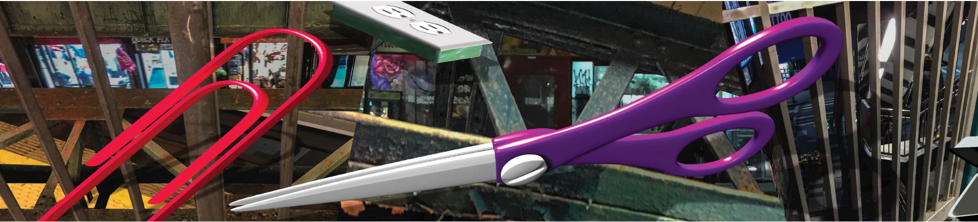
Sidewalk Shed Artwork, detail