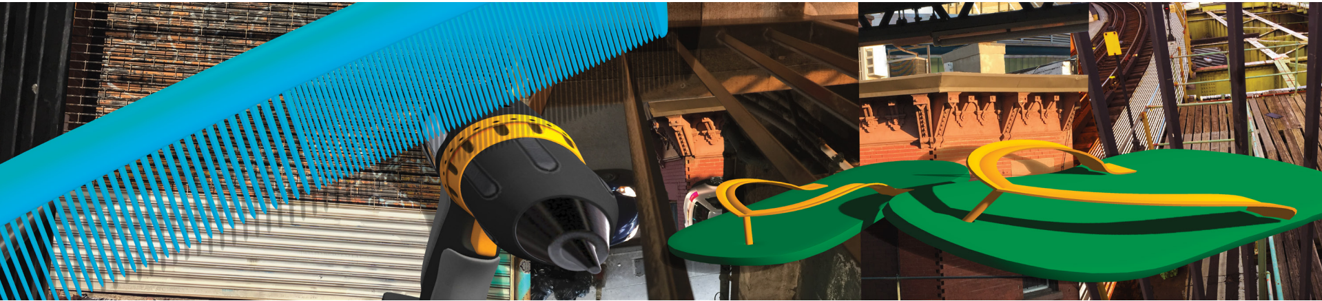
Construction Fence Artwork, detail