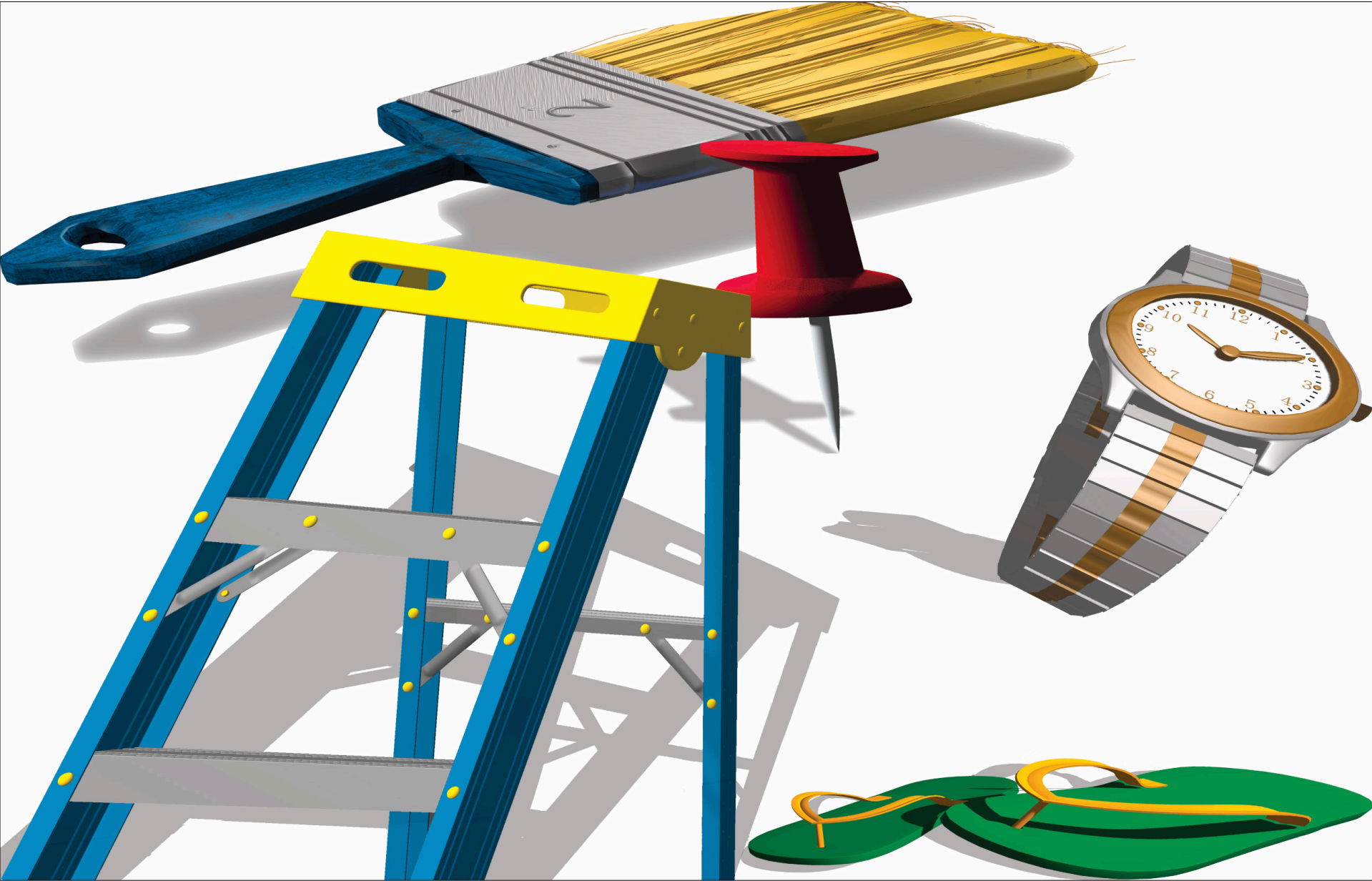
Supported Scaffold / Netting Artwork