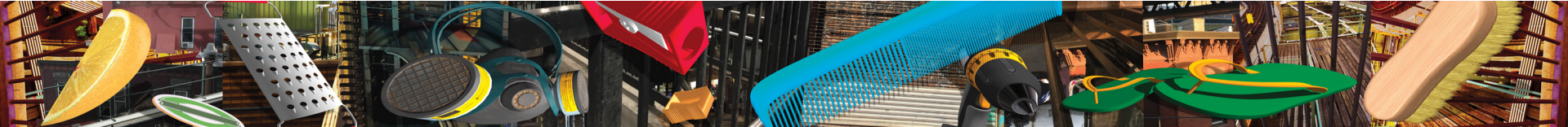
Construction Fence Artwork