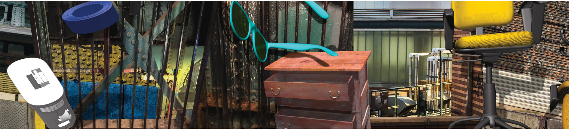
Sidewalk Shed Artwork, detail