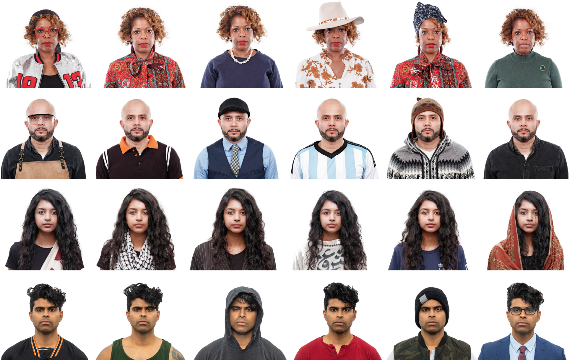
Supported Scaffold / Netting Artwork