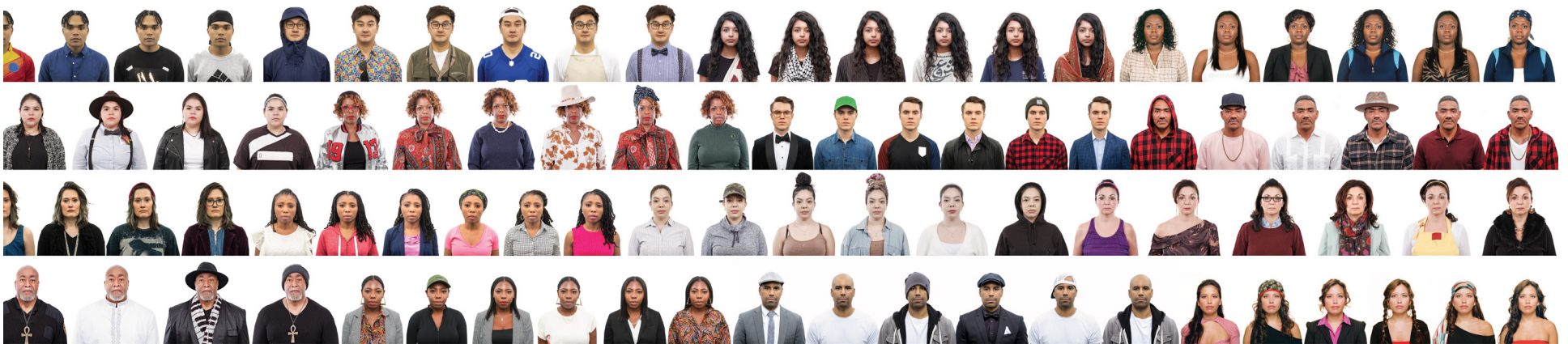
Construction Fence Artwork, detail