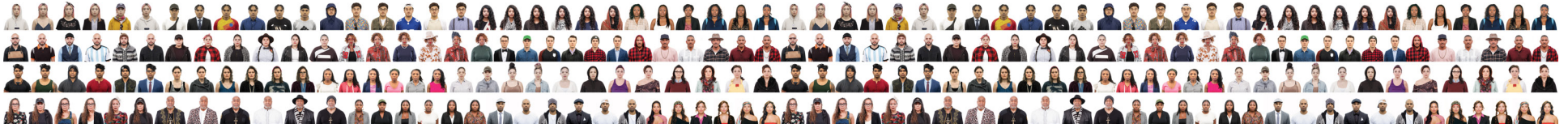
Construction Fence Artwork