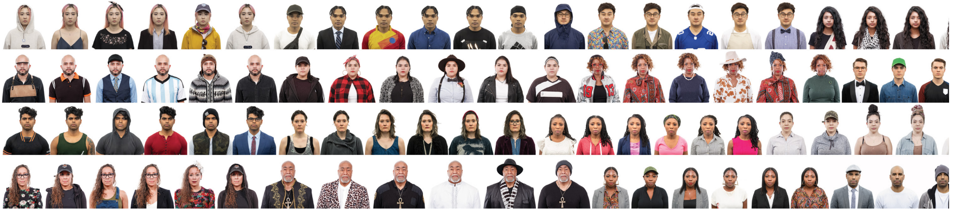
Construction Fence Artwork, detail