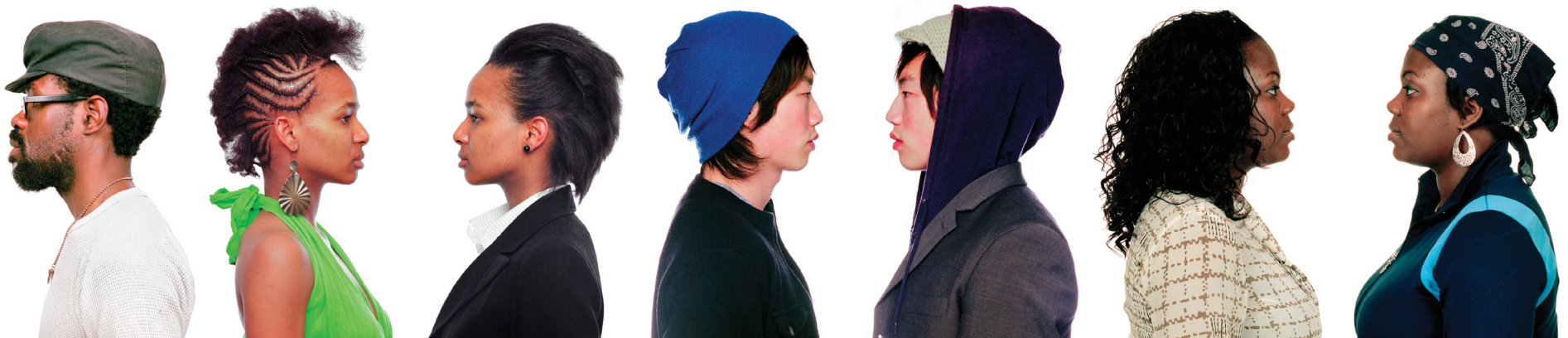
Sidewalk Shed Artwork, detail