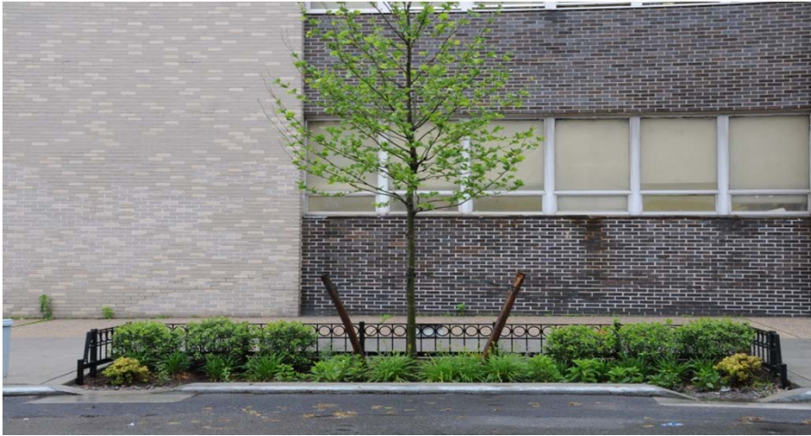
Right of Way Bioswale