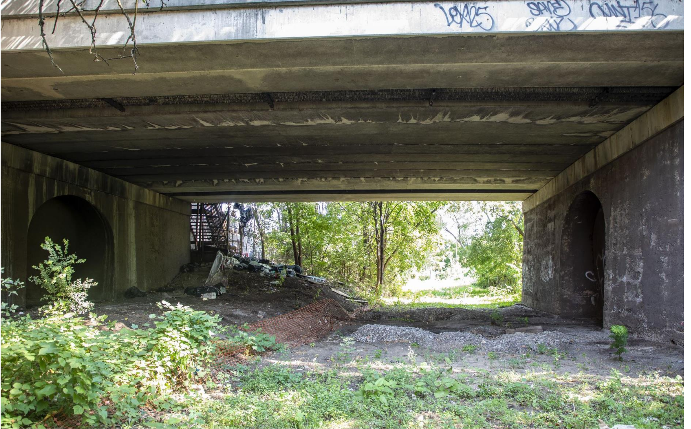
BEDC tours Tibbett's Brook daylighting project along the Major Deegan Highway, September 9