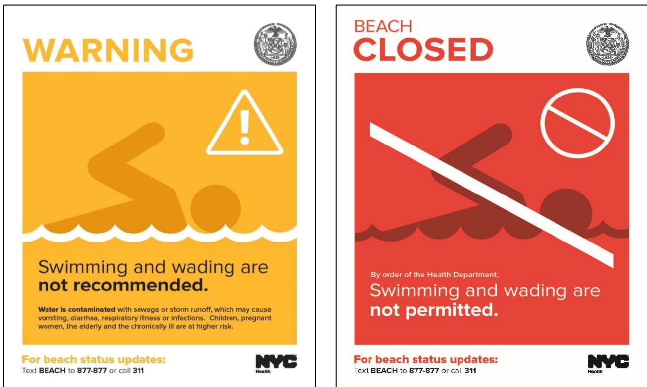
FIGURE 2: BEACH WARNING AND CLOSED SIGNS

The Department continued its effort to improve public notification and risk communication during the 2019 beach season. Easy-to-interpret signs shown in Figure 2 were used for beach closures and warnings in 2019.