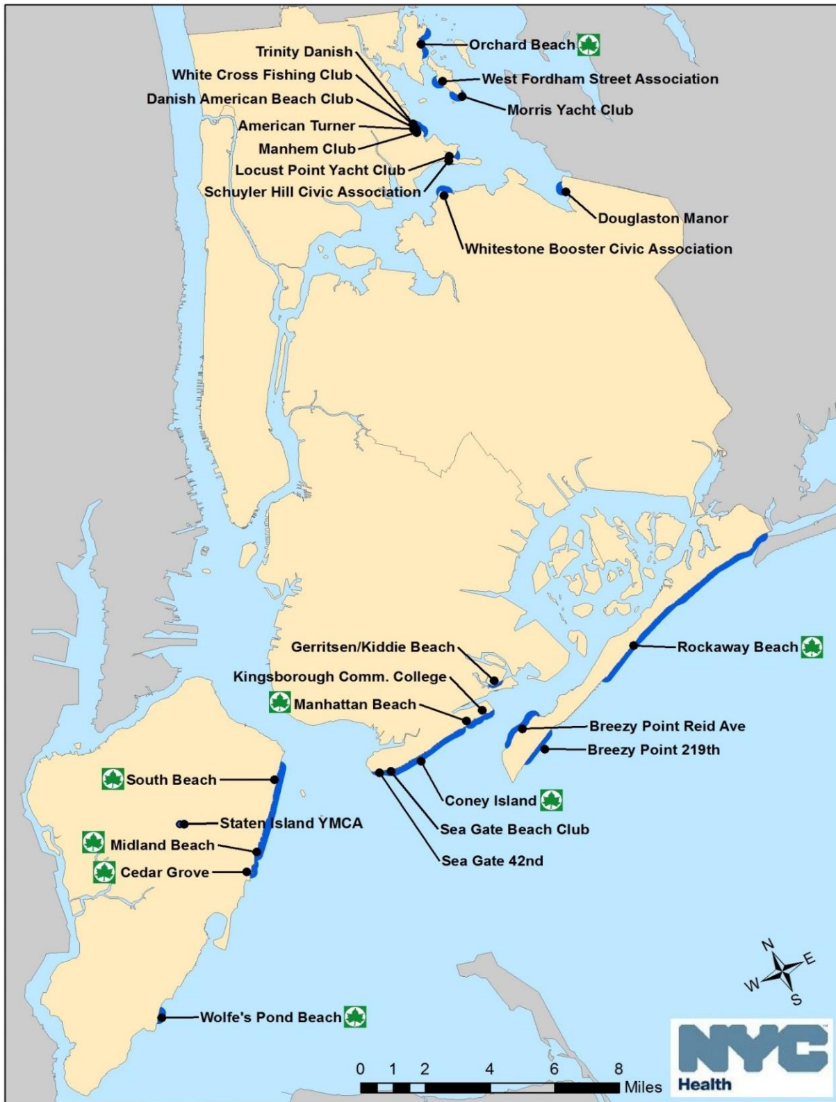
FIGURE 1: NEW YORK CITY PERMITTED BEACHES