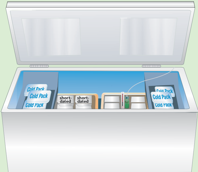
Ultra-cold chest freezer

✓ Place vaccines with shorter expiration dates toward front of shelf. All expired vaccines should be reported to the returns/wastage section of the CIR.