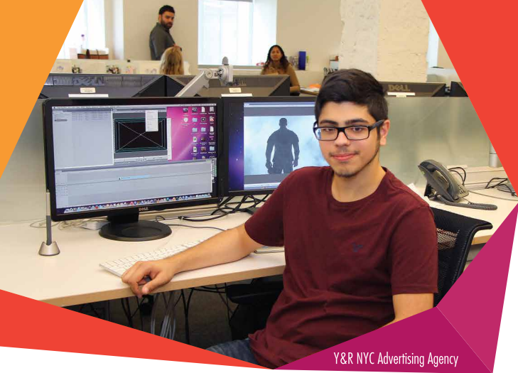
Y&R NYC Advertising Agency