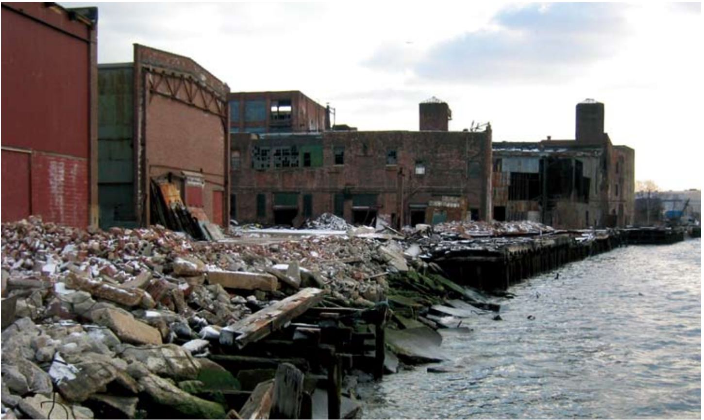
The Greenpoint Terminal Market site on the Brooklyn waterfront.

competitive with development on clean sites. The Mayor's Office of Environmental Remediation is currently developing a Green Property Certification Program to provide certification that a former brownfield site has been cleaned up. Certification will be awarded to properties that complete the NYC BCP or the equivalent program on the state level.