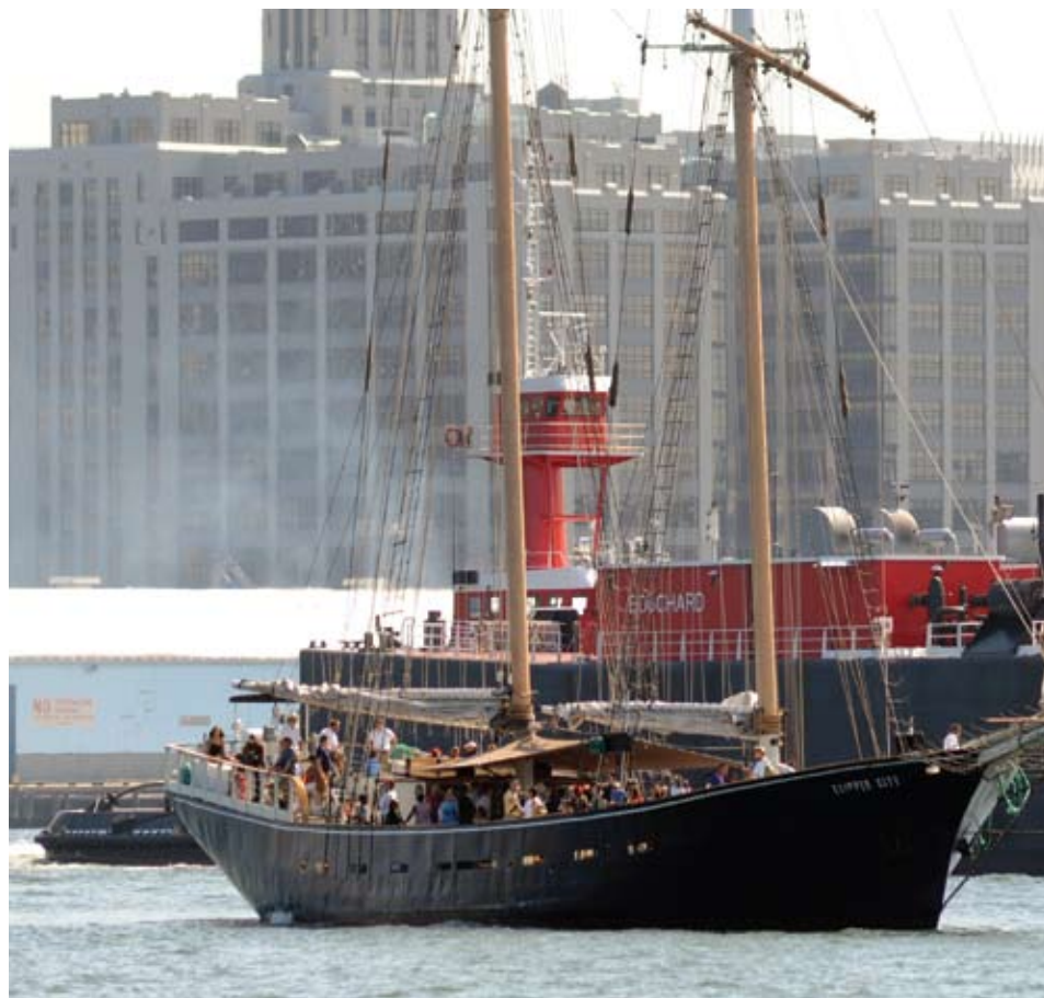
The Clipper City Tall Ship, just off Sunset Park. In the background: the 1918 Brooklyn Army Terminal.

This has been done successfully throughout the city, such as at the Gantry Pier at IKEA Waterfront Plaza in Red Hook, Brooklyn, where cranes and piers were retained and industrial artifacts displayed in publicly accessible areas accompanied by commemorative plaques.